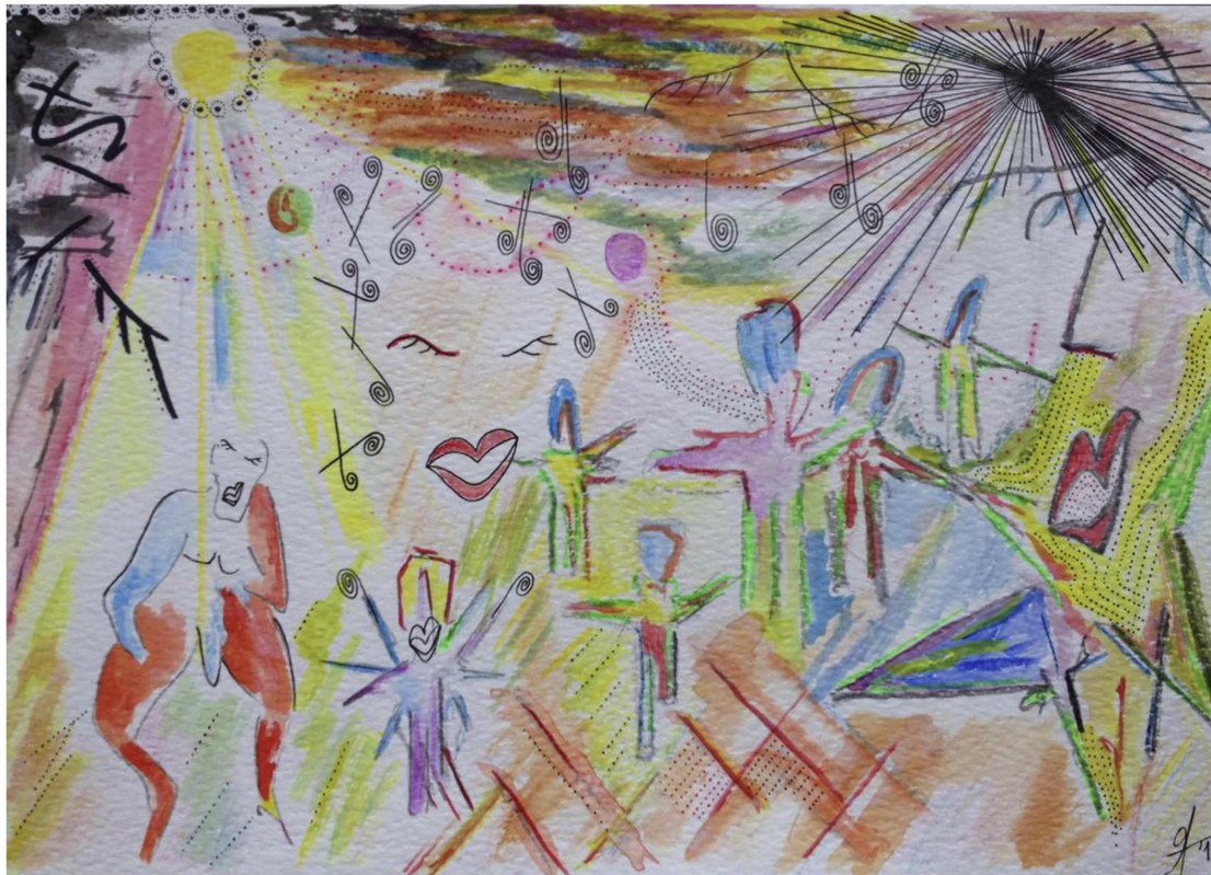
Fig. 1. Techno-space. Drawing by the author.

what you want to become, and, then, fall in love with yourself, as if I myself am an epitome of Pygmalion.