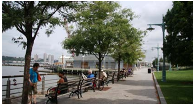
Figure 2. Waterfont public walkways.

Another important feature of New York's public green spaces is waterfront. According to the definition of coastal areas is the area located in the immediate vicinity of the shoreline, and its scope determines the parallel line away from the shoreline about 800 feet (about 244 meters) inland, while the water-side boundary is the line of the breakwater. Due to the huge impact of these areas on the image of the entire city, they are bodied by specific legislation. Regulations are formulated in the framework of special districts or individually set for each location, both in Manhattan and in other neighborhoods. Waterfront zoning is not only to control the process of building the city, forming its skyline (especially important in the case of Manhattan), but also the social benefits of these areas due to their unlimited accessibility for residents of New York City. Assumptions of the basic rules, introduced in 1993, and reformed in 2009, was to provide the largest public green space along the shoreline, which thanks to its special advantages, landscape, bring valuable new value to the urban landscape.