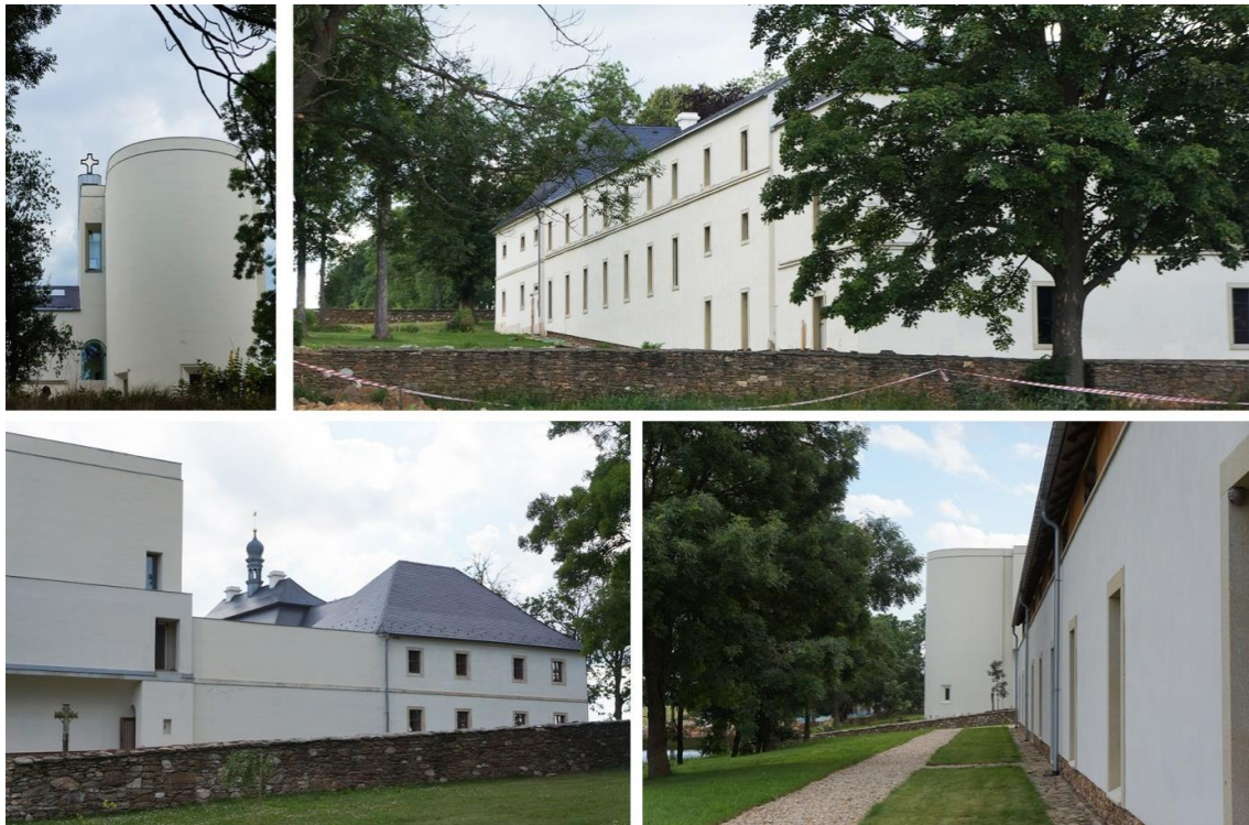
Figures 25-28. Monastery of Nový Dvůr, Czech Republic