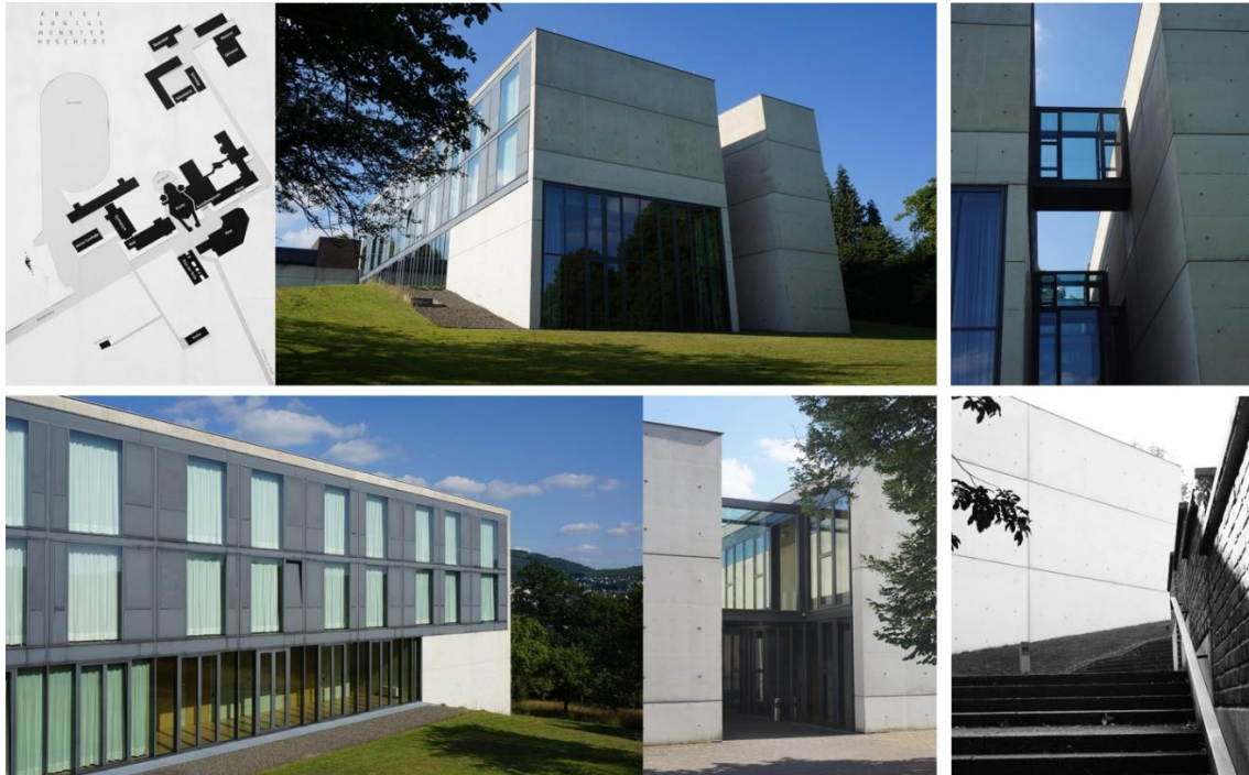
Figures 10-15. Haus der Stille, Königsmünster-Meschede, Germany