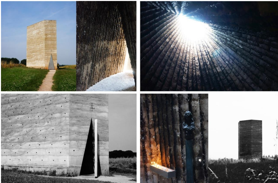
Figures 1-4. Bruder Klaus Field Chapel, Mechernich-Wachendorf, Germany