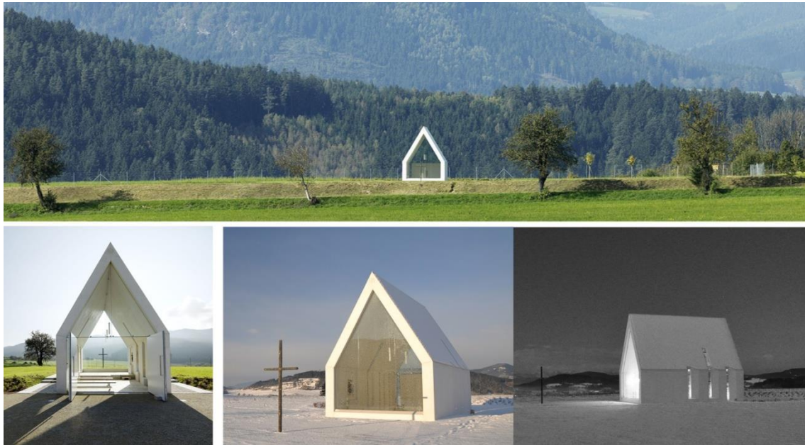
Figures 16-19. Chapel Maria Magdalena, Zollfeld, Austria

Source: http://www.archdaily.com/770771/chapel-maria-magdalena-sacheocierrchitectes