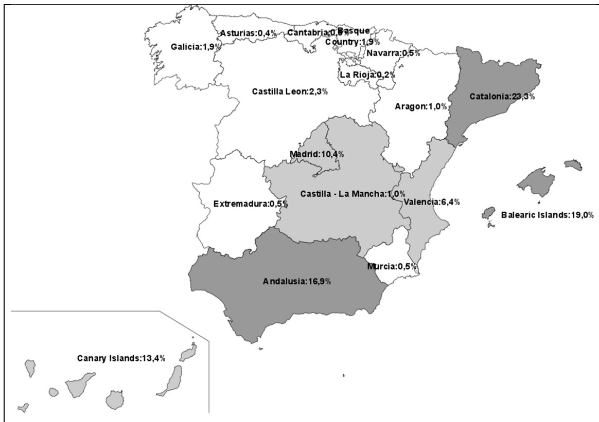
Fig. 1 Frequency distribution of tourist arrivals to Spain by region (mean from 1999:01 to 2014:03)

Tang and Abosedra (2015), Pérez-Rodríguez et al. (2015) and Chou (2013) have shown the important role of tourism in economic growth. In this study we use data on international tourism demand to all regions of Spain provided by the Spanish Statistical Office (National Statistics Institute – INE – www.ine.es ). Data include the monthly number of tourist arrivals at a regional level over the time period 1999:01 to 2014:03. A MIMO approach to regional economic modelling is particularly appropriate when the desired outputs are connected (Claveria et al., 2015). In Fig. 1 we present the frequency distribution of tourist arrivals by region during the sample period. We can see that most tourist arrivals are concentrated in the Mediterranean coast and the islands, being Catalonia, the Balearic Islands and Andalusia the regions that received the higher number of tourist arrivals, which almost amounted to 60% of total tourist demand.