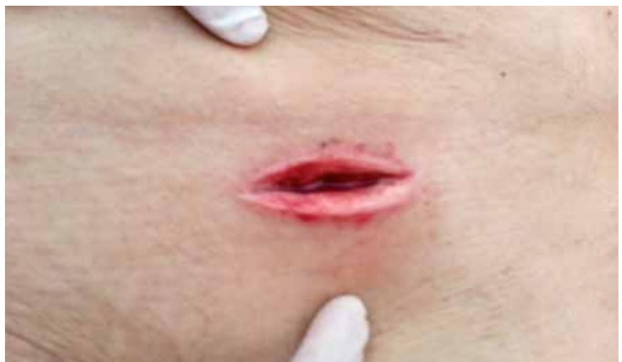
Figure 2. The incision in the lower abdominal wall following surgical debridement

Other diagnostic procedures for necrotising fasciitis include the LRINEC (Laboratory Risk Indicator for Necrotising Fasciitis) which is a scoring system developed by Wong et al. 5 The C-reactive protein, creatinine, haemoglobin, leukocyte count, serum sodium and glucose are used in this score. A score of 6 'raises the suspicion' and a score of 8 is 'strongly predictive' (table 1). A score of 7