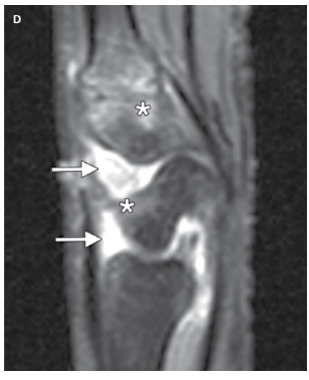
Figure 1: Synovitis in early RA of the wrist (6 months duration); patient had normal radiographic findings. (A) Coronal T1-w MR image shows extensive synovitis (arrows). On STIR (B) and axial fat saturated T2-w (C) MR images, the synovitis has high signal intensity (arrows). * indicate bone marrow oedema at the bases of the second metacarpal, capitate, and hamate bones. (D) Sagittal contrast-enhanced fat-saturated T1-w MR image shows intense enhancement of the periscaphoid synovitis (arrows), in the area of bone marrow oedema in the scaphoid bone and in the base of the second metacarpal bone (*).