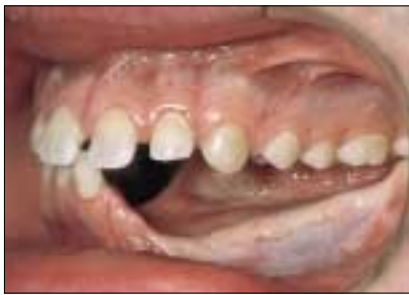
Figure 2a: The left mandibular dentition and its supporting tissues were lost after surgical resection for treatment of a tumour. The grafted site hosts 4 long implants placed in an offset manner to optimize lateral stress resistance.