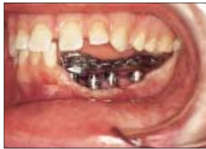
Figure 2b: Interarch space allowed for use of stock prosthetic teeth attached to a silver-palladium framework.