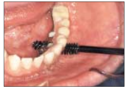
Figure 2c: The casting technique is similar to the one used when designing saddle areas for removable partial dentures. The favourable circumoral activity allows for generous space under the pontics and around the implant abutments for maintenance of hygiene.