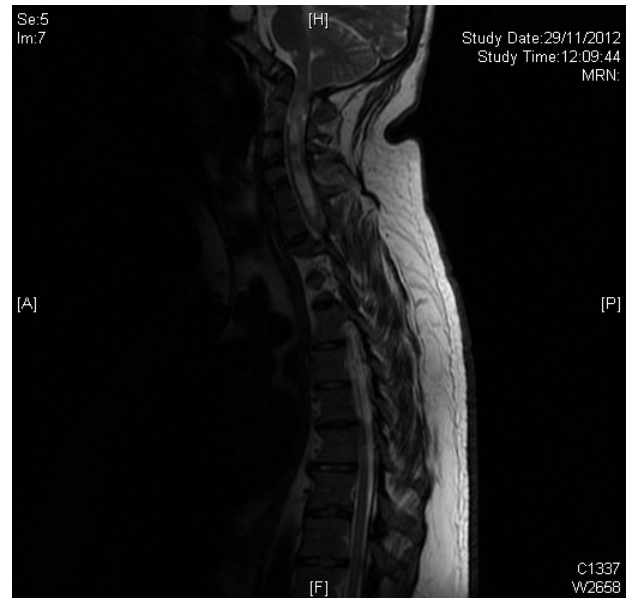
Figure 4: MRI scan showing the syrinx within the cervical spinal canal and vertebral fusion