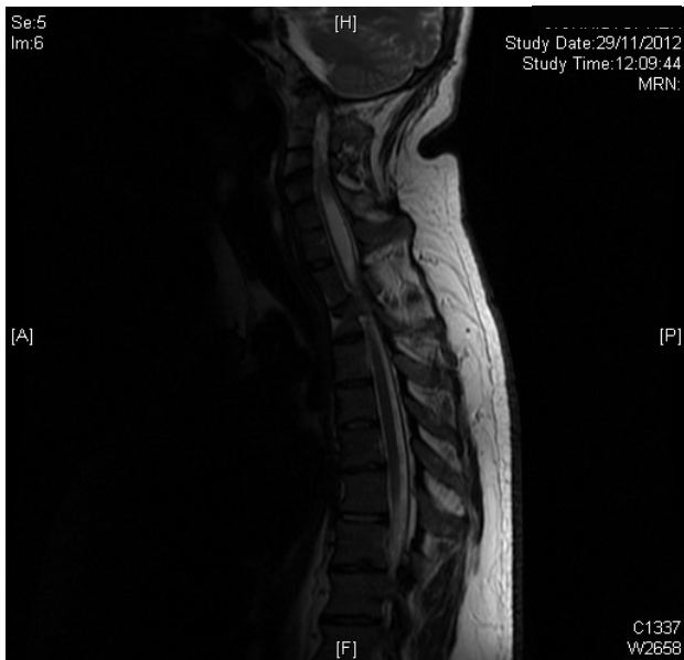
Figure 3: MRI scan showing the syrinx within the cervical spinal canal and vertebral fusion