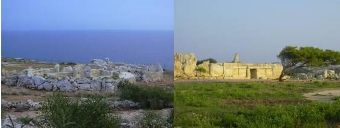
Figure 1 Mnajdra and Hagar Qim

These monuments are generally acknowledged to be places of worship and may have been central features of a settlement or territorial division (Joussame 1985: 222). Contemporary with these temple sites are rock-cut tombs and structures. The most impressive of which is the Hal Saflieni hypogeum, an underground structure, which is constructed on a similar plan to the temples. When excavated these underground chambers were found to contain a huge quantity of burials in its 20 chambers, adding up to an MNI (minimum number of individuals) of almost 7,000 (Joussame 1985: 222). The main room of the hypogeum echoes the architecture of the temple sites including doorways mimicking the style of the uprights and lintels above ground (Whittle 1996: 317). Designs of spirals, lines and dots painted in red ochre survive on the walls and reflect the designs carved into the megaliths at the temple sites.