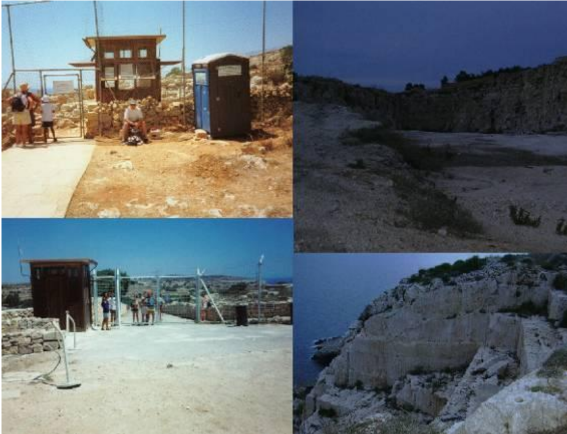
Figure 2 – The reality of security fences and quarrying at Mnajdra and Hagar Qim

Although the setting of Hagar Qim and Mnajdra appear relatively unaffected by modern development, two major issues affect the sites both on an aesthetic and very practical level.