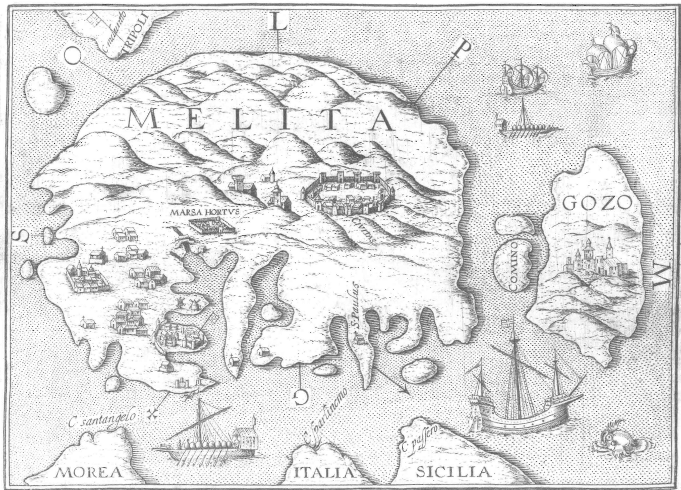
Map 2: The copper- engraved Quintinus map published in Frankfurt in 1600 in Italiae Illustratae