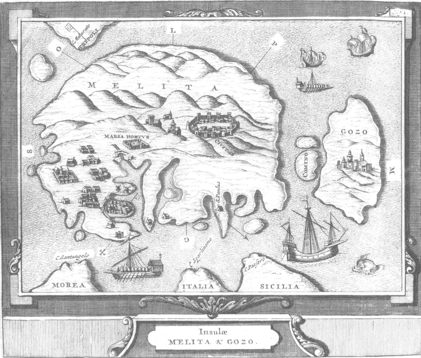
Map 3: The Quintinus map published in Leiden by Pieter van der Aa in two major works, first in 1725 and then in 1729