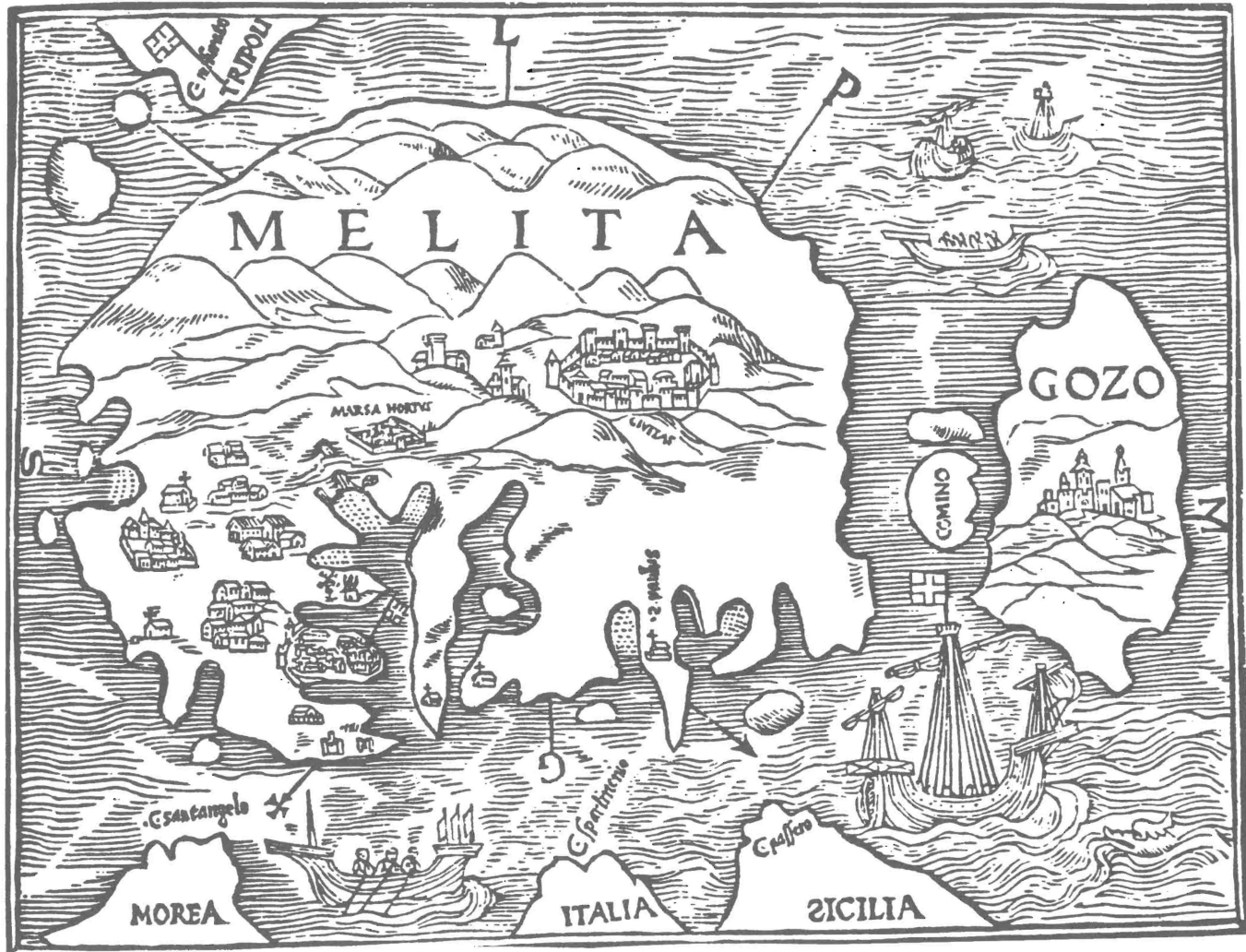
Map 1: The wood-cut map by Johannes Quintinus drawn in 1533 and published in Lyons in 1536