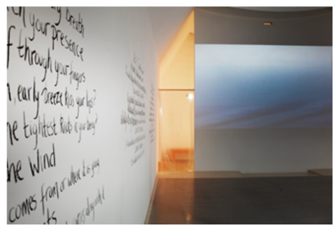
Figure 2: Installation views from Sanctuary - Where is the Patient? (Baldacchino, 2014) at the exhibition Propolis: Artwork as Social Interstice, St. James Cavalier, Valletta, Malta.