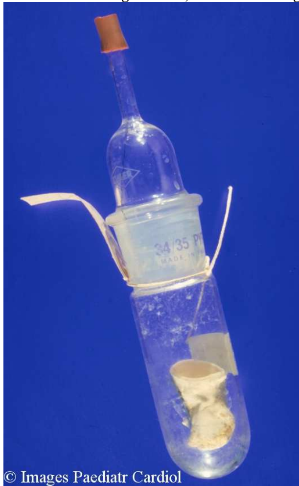
Figure 2: The first aortic homograft used, in a sterile air-tight container.

The homograft was rehydrated and reconstituted and placed in the subcoronary position. The patient lived for several years with a near normal functioning aortic valve (figure 3).