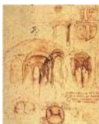
Figure 9 Drawing of the mitral valve

The study of human anatomy freed itself completely from the shackles of Galenic theory by the publication in 1543 of the first complete textbook of human anatomy by Andreas Vesalius (1514-1564). Vesalius proposed that the heart was the centre of the vascular network, and believed that the pulmonary veins carried air from the lungs to the left atrium 6 . Vesalius' monumental work opened the doors to further advances.