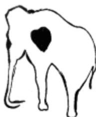
Figure 1: Abbe' Breuil's reproduction of a mammoth from a cave drawing

Primitive man as early as circa 30,000 years ago was almost certainly aware of the life-driving force of the heart. In 1908 Abbe' Breuil, the father of the study of prehistoric art, sketched in red chalk the mammoth drawn by Aurignacian man in the cave of Pindal in Northern Spain. This 16.75 × 17.5 inch drawing was noted by Breuil to have "A broad, almost heart-shaped spot, placed in the middle of the body". He first believed this to indicate the flap of the ear, but later objectively described the infill as "A broad red spot covers the place where the heart should be situated". 1 Generally assumed to be a depiction of the heart which the hunter had to aim for, the Aurignacian drawing indicates primitive man's knowledge of the vital role of this organ in sustaining life.