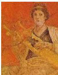
Figure 5 Herophilus of Chalcedon

was derived from the heart. He distinguished the pulse not merely on quantitatively grounds, but also qualitatively from palpitations, tremors and spasms, which are muscular in origin. Unfortunately, since the pulse doctrine of Herophilus was based on musical tenants, it was so complicated that only a skilled musician could possibly understand it, and this the theory failed to gain ground 4 .