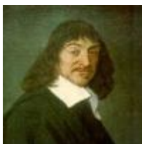
Figure 14 René Descartes

The final link to Harvey's concept was made by the discovery of capillaries in frog experiments by Marcello Malpighi (1628-94). Malpighi also demonstrated the existence of red blood cells and showed that they gave blood its colour.