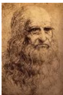
Figure 7 Leonardo da Vinci (self portrait)

da Vinci (1452-1519) drew and described a case of atrial septal defect. Leonardo also subscribed to the Galenic theory of flux and reflux through the veins. 5