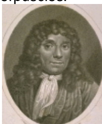
Figure 16 Antoni van Leeuwenhoek

Malpighi's findings were confirmed and developed by Antoni van Leeuwenhoek (1632-1723), who demonstrated how red blood cells circulated through the capillaries of a rabbit's ear and the web of a frog's foot. In 1674, Leeuwenhoek gave the first accurate description of red blood corpuscles.