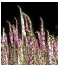
Figure 18 Foxglove ( Digitalis purpurea )

The diagnostic and treatment armamentarium available today has given practitioners the means of effectively dealing with the problems arising from cardiac malformations. The new millenium which will no doubt see further innovative developments. It is only fitting that the basic groundwork done by our predecessors in the previous millenia should be acknowledged. In the words of the leading 14th century surgeon Guy de Chauliac: "We are like children standing on the shoulders of a giant, for we can see all that the giant can see, and a little more".