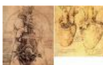
Figure 8 Anatomical drawings of the circulatory system and the heart by Leonardo