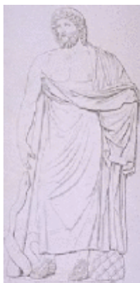
Figure 2 Hippocrates