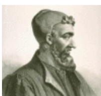
Figure 6 Claudius Galenus

It was disproved by Claudius Galenus (AD 129-201) who showed by experiment that arteries carried blood and not air. He studied the actions of the heart, the heart valves, and the pulsations of arteries. Galen also noted the structural differences between arteries and veins but did not realise that blood circulated. He believed that blood was produced by the liver which sent it to the periphery of the body in order to form flesh. He was also the first to attempt to explain the function of the arterial duct and the foramen ovale 5 . Galen subscribed to the humoral theory of bodily fluids, but he also believed that sickness could arise from an insufficiency of one of the four humours, and not only from an excess, a guiding principle of Galenic medicine. Galen also believed that life was sustained by food, which was converted into blood by the liver and sent to the rest of the body for nourishment. Galen also believed that blood was used in the removal of wastes. Galen was thus the first to suggest a relationship between food, blood and air. Medical and church authorities considered Galen's work to be based upon divine inspiration and therefore infallible, dubbing him Divinus Galenus. 4,5