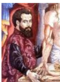
Figure 10 Andreas Vesalius

The study of human anatomy freed itself completely from the shackles of Galenic theory by the publication in 1543 of the first complete textbook of human anatomy by Andreas Vesalius (1514-1564). Vesalius proposed that the heart was the centre of the vascular network, and believed that the pulmonary veins carried air from the lungs to the left atrium 6 . Vesalius' monumental work opened the doors to further advances.