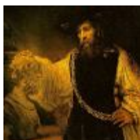
Figure 4 Aristotle contemplating a bust of Homer (Rembrandt)

For the ancients, the functions of the heart and blood vessels were a great mystery. Alcmaeon of Croton, a Greek (circa 500 BC), suggested that sleep was caused by blood draining from the brain via the veins, and that death was the result of the brain becoming completely drained. Two hundred years later, Aristotle (384-322 BC) ascribed the power of thought to the heart, which he contended also contained the soul. He also is credited with the earliest observations of normal cardiovascular function by describing the fetal pulsations in a chick embryo. After the death of Hippocrates, medical thought and practice centred on Alexandria where the first great medical school of antiquity was set up. The study of the human body reached its full development with human dissection being permitted. The original writings of the chief thinkers of the Alexandrian School have not been preserved, but scrappy and imperfect knowledge has been afforded by later Roman writers including Pliny, Celsus and Galen. The two most distinguished names of the Alexandrian School included Herophilus and Erasistratus.