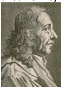
Figure 15 Marcello Malpighi

The final link to Harvey's concept was made by the discovery of capillaries in frog experiments by Marcello Malpighi (1628-94). Malpighi also demonstrated the existence of red blood cells and showed that they gave blood its colour.