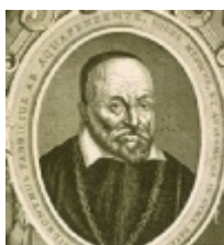
Figure 11 Hieronymus Fabricius ab Acquapendente

Realdus Columbus (1516-1559) also showed that the pulmonary veins carry blood, not air 5 and Hieronymus Fabricius ab Acquapendente (1533-1619) described valves in veins, recognising them as general structures in the venous system and calling them little doors “ostiola”. 4,7