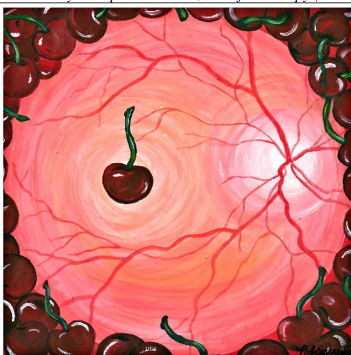
Figure 2: Cherry-red spot as visualized on fundoscopy (See Table 1)

*Underlying disease is usually inherited in an autosomal recessive manner, Some cutaneous food-related medical terms may not be applicable in those with pigmented skin Please see the Supplementary appendix for a more detailed table