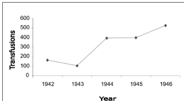
Figure 1: The number of blood transfusions performed in Malta between 1942-1946 3

A notice published for the Post of Registrar Pathology and Blood Transfusion to work at SLH, in the Maltese Government Gazette, 25 th June 1971, stated that "the post will be tenable for a period of 3 years. On termination of appointments candidate will not be eligible for any pension, gratuity or retiring allowance. If it will be a female she will be required to resign her appointment on marriage."