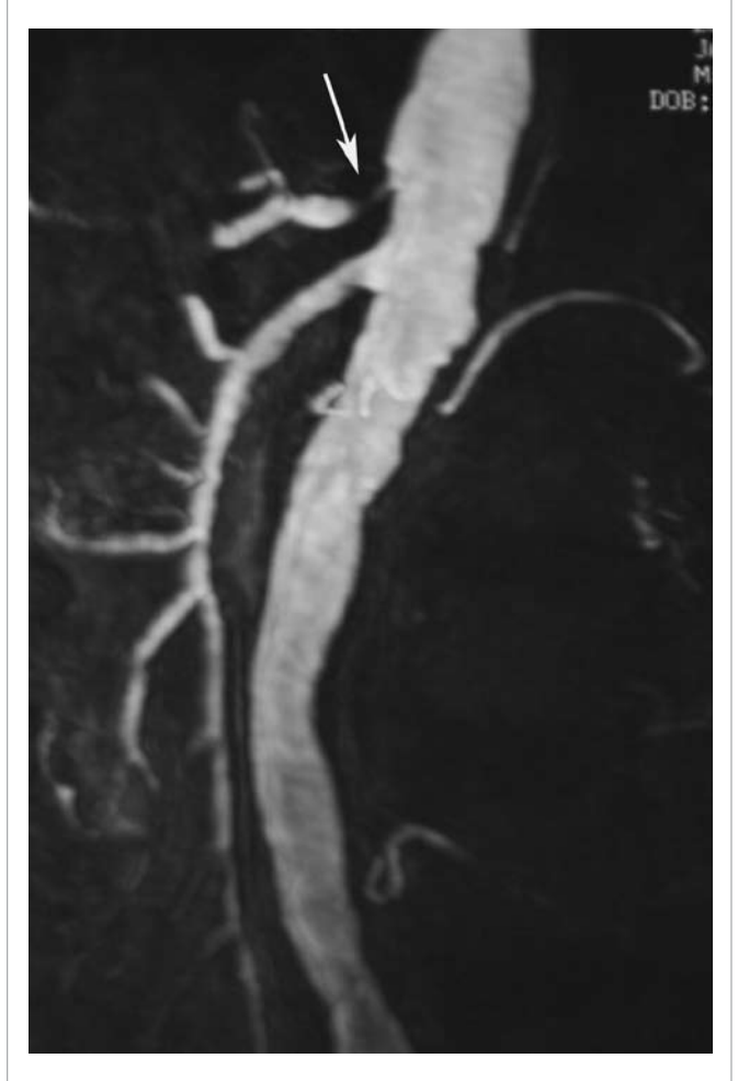
Figure 1: Sagittal view Magnetic Resonance Angiogram (MRA) of the descending aorta showing 70-80% stenosis of the coeliac artery (arrow) with an intact superior mesenteric artery entering the small bowel mesentery

Magnetic resonance angiogram of the abdominal aorta showed diffuse atheromatous disease. Significant atheroma was seen around the origin of the coeliac axis (CA) with severe 70-80% stenosis involving the proximal centimetre of the CA. Superior mesenteric artery (SMA) was normal (Figure 1).