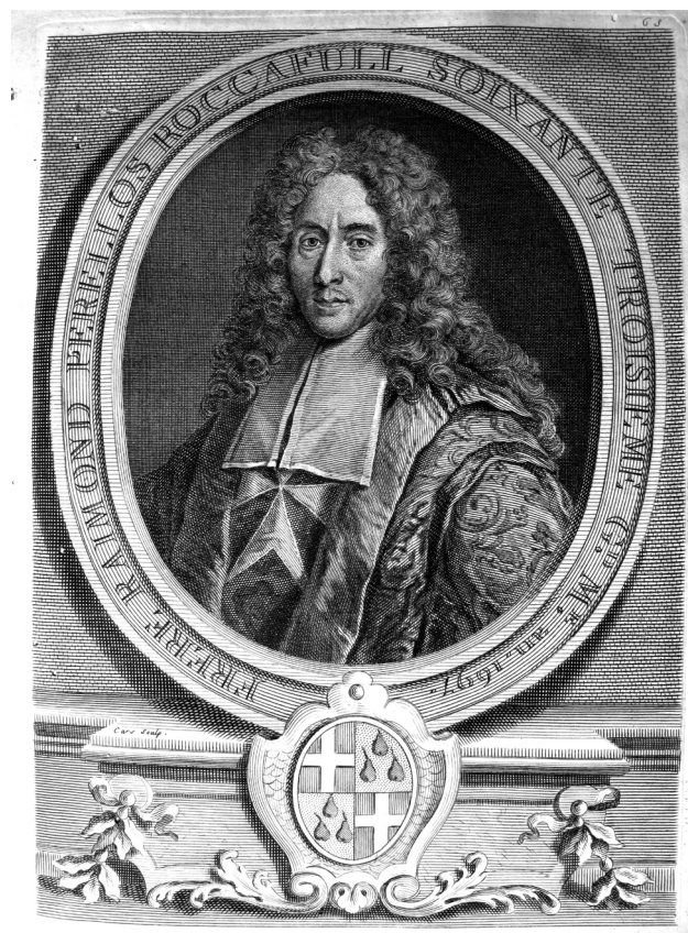
Figure 3: Legend Portrait of Grandmaster Raimond Perellos