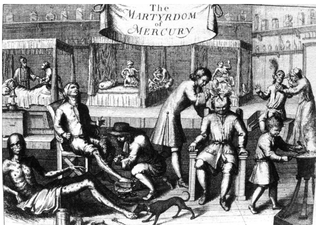
Figure 2: The mercury treatment for syphilis in the 18th century