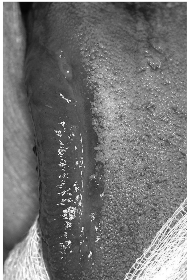
Figure 1b: Six weeks after reduction of nicorandil therapy