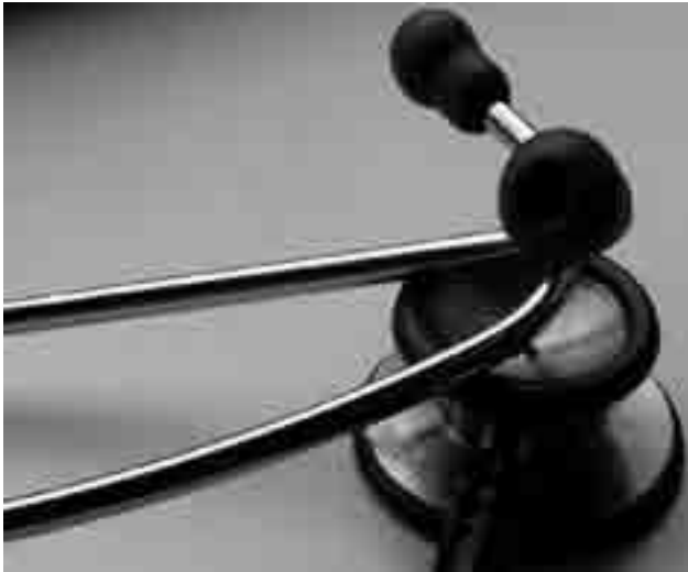
Figure 3: An acoustic binaural stethoscope

also been falling but electronic stethoscopes are still nowadays more expensive than a good acoustic model.