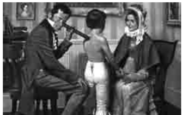
Figure 2: Laënnec auscultating a child's back with his stethoscope

Electronic stethoscopes have been available for quite some time, but these devices per se have generally provided only a minimum level of improvement over their mechanical predecessors. Other disadvantages include their expensive retail price, the frequent complaint of 'background noise', and that although described as 'electronic', most of the devices cannot interface with computers; but with the recent advancements in technology, these limitations are rapidly decreasing. Costs have