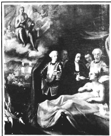
A Grandmaster of the Order of St. John administering to the sick at the Holy Infirmary: An Allegory. Oil Painting at the National Museum.