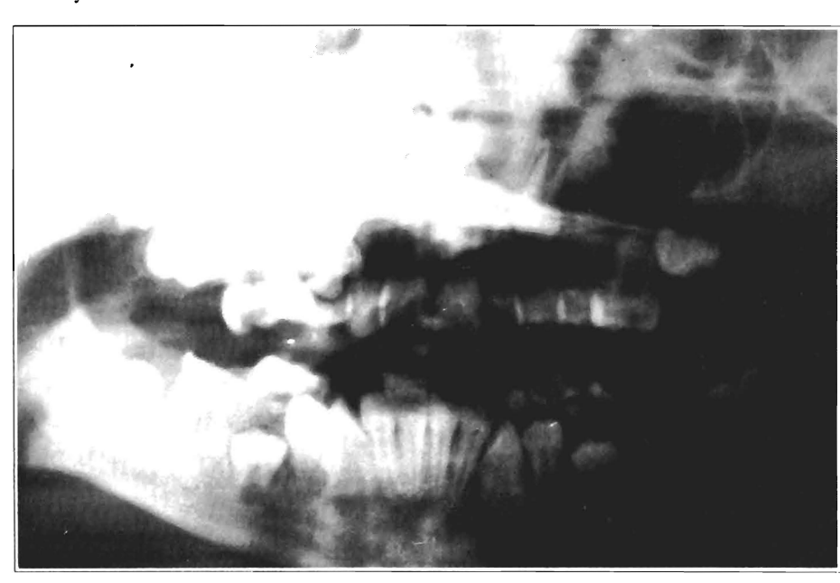
Fig. 3 - An orthopantomographic view showing not only the developing dentition but also the extensive decay of all four first molars

The most common etiologic factor giving rise to cutaneous lesions in the head and neck region yielding intermittent purulent drainage is the of extension a chronic odontogenic infection <sup>2,3</sup>. The primary site of infection