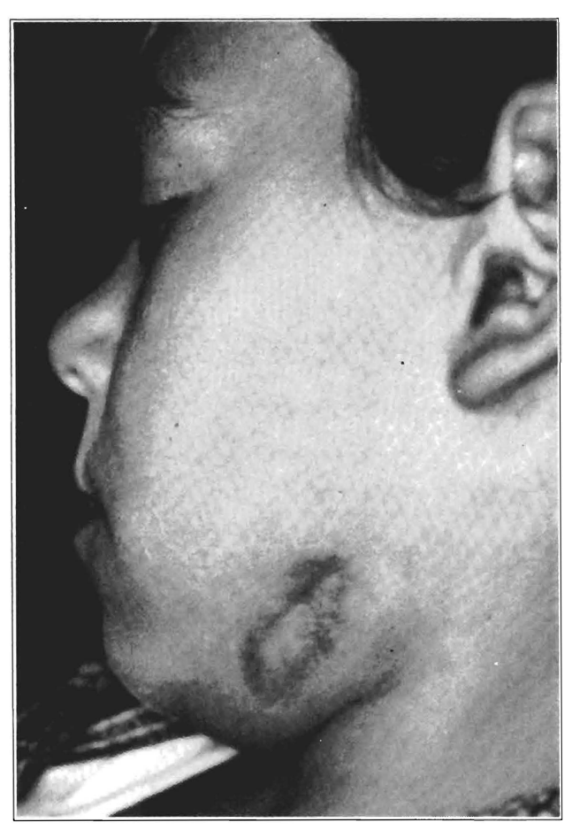
Fig. 4 - Six months post-extraction (Dec 1995): the sinus healed completely but the area remained dimpled and pigmented