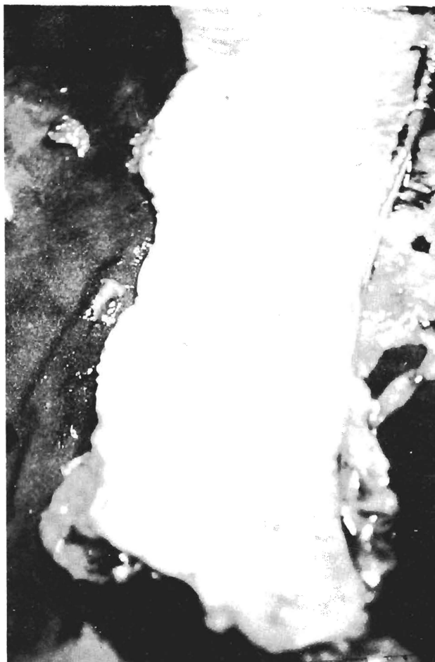
Fig.4 - Case A: multiple polyps in subtotal colectomy specimen.

There was a desmoid tumour arising from the previous laparotomy scar infiltrating all the layers of the abdominal wall. There were a large right and a small left ovarian endometriotic (chocolate) cysts.