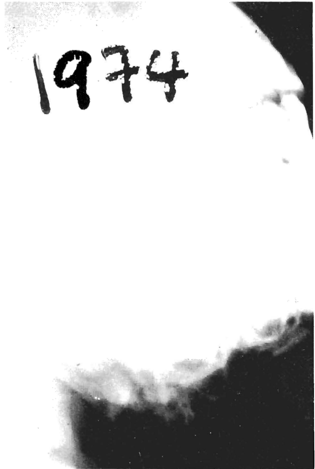
Fig.5 - Case B: fibrous dysplasia of the mandible and supernumerary teeth.

The dental surgeon 11 who first treated these two siblings for mandibular osteomata and supernumerary teeth had rightly suspected Gardner's syndrome as the underlying cause of these oral problems. It was, however, years later that the two girls presented with symptoms related to polyposis coli and abdominal desmoids and the serious implications of the underlying conditions were recognised. Surely a Familial Polyposis