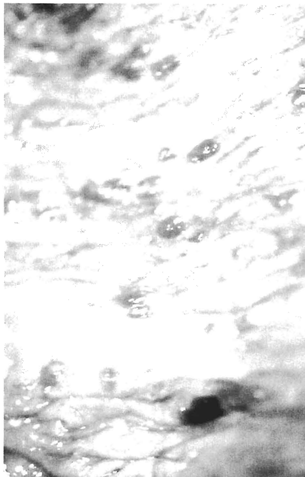
Fig.1 - Case A: multiple polyps in colectomy specimen.

A 25 year old woman presented in June 1995 with two episodes of rectal bleeding and suprapubic pain. On examination she had an indurated hypertrophic lower abdominal scar resulting from a laparotomy for colonic perforation due to an ingested needle nine years previously. There was also a pelvic mass which was shown to be a large multilocular ovarian cyst on ultrasound examination. She also had multiple fibromata