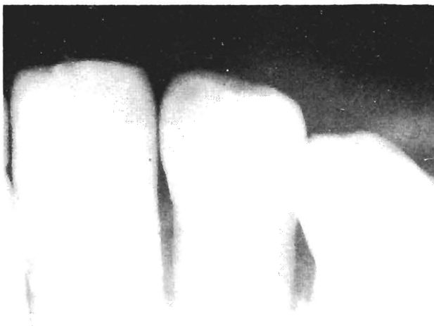
Fig.3 - Case A: supernumerary teeth.

the age of 12 years, and excision of osteomata of the mandible at 17 years. At the time she was also noted to have other dental abnormalities including supernumerary teeth (Figure 3). A 2.5cm lump arising from the rectus sheet had been excised in 1992. Histology showed well-organised fibrous tissue. She was considered to be at high risk of developing colonic carcinoma and was advised to undergo laparotomy for colonic ablation and excision of the large ovarian cyst. Findings at laparotomy included dense adhesions matting the whole of the small intestine into a solid mass with fibrosis/calcification and severe shortening of the mesentery.