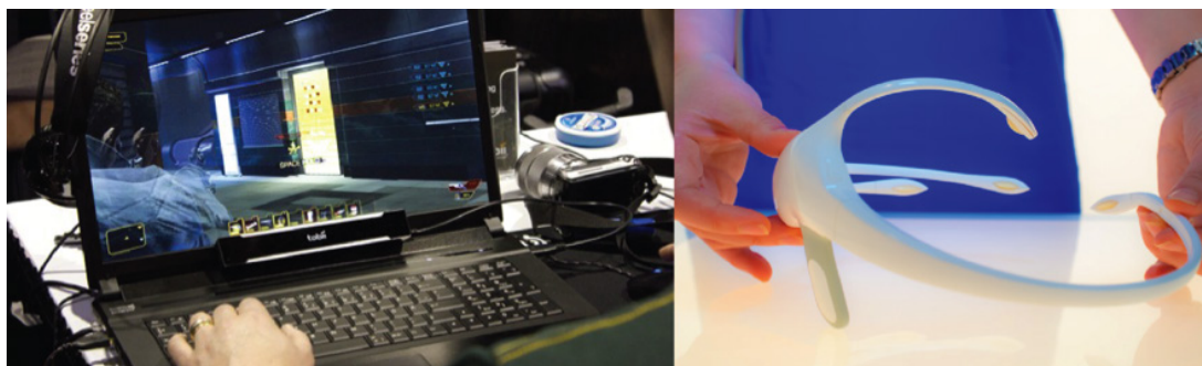
Figure 2: Tobii's EyeX eye tracking device and Emotiv's Insight brain interface.

In this PUI approach very recent input devices can be seen in figure 2, such as brain computer interfaces Emotiv 6 , the Insight, and eye tracking interfaces Tobii 7 , the EyeX, devices are accessible and ready to integrate future development of personal computational device's operating systems for a still more engaging technology mediated interaction experience.