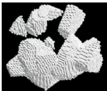
Figure 26. Example of irregular agglomerated debris particle