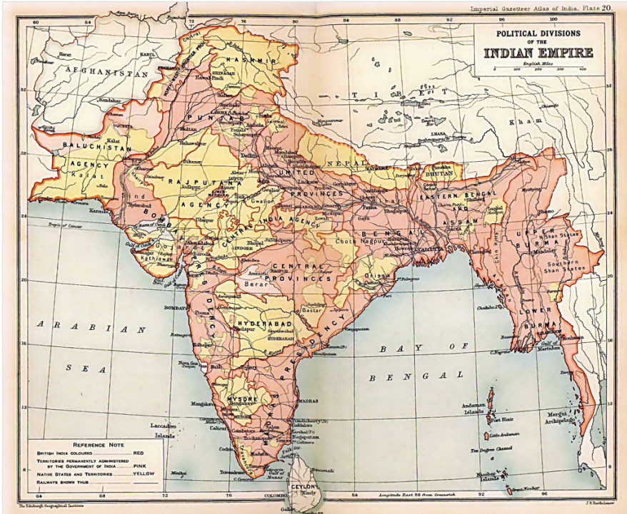
Figure 2. Map of the Indian subcontinent showing the historical extent of “British India” published in 1909. Map source Edinburgh Geographical Institute; J. G. Bartholomew and Sons. [Public domain], via Wikimedia Commons.

Historically the regions making up the Indian subcontinent have had a complex nomenclature (Figs 2, 3), further compounded by different authors interpreting locality labels to mean different regions. In particular the confusion between East India, East Indies, India, Indo-China and Indonesia, will mean that some species included in this list are unlikely to occur in the focal region, but are included until further study proves otherwise.