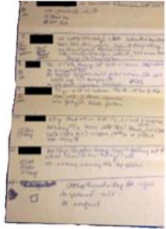
Figure 3. Bespoke chart.