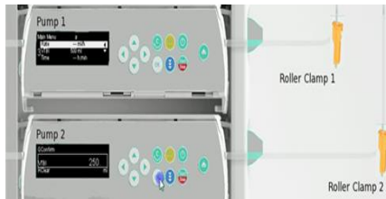
Figure 1. Pump simulator.

Traditionally, the focus of chart improvements has been on transcription legibility and ensuring all relevant information is recorded [1]. Charts are often highly structured documents with restrictions on the nature and format of what can be recorded. This can make it impossible to appropriate them in a way that supports an individual's device programming activities. We are concerned with how chart design influences the end-user programming procedure, and how this impacts on the likelihood of errors being made. Our focus is on how safety manifests itself in everyday practice using prescription charts, and how those practices are developed through training and experience.