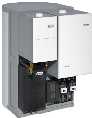
Fig. 4 Elcore 2400 0.3 kW CHP System