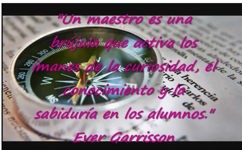
Figure 3: Metaphoric meaning with a compass in Artefact 10

With regard to the digital characteristics of the artefacts as OER, more than a half of the artefacts include one or more photographs taken by the students themselves. Most of these depict their own childhood and show moments of play, free time and happiness. Photographs with Creative Commons licenses also tend to depict images of children/childhood and in one case used to communicate metaphoric meaning: Artefact 10 represents the figure of the teacher using a compass (see Figure 3).