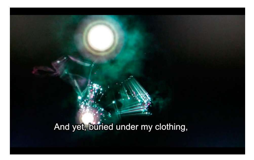
Figure 7. Still frame of multi-coloured bursts of light against a black background, with a caption reading 'And yet, buried under my clothing', describing inner biopedagogies used to maintain self-starvation. From Litany of White Noise by Jen Rinaldi.

Rinaldi ran an audio synthesiser and held a camera up to a desktop screen, a technique that introduces an unsteady hand to the production, and in fleeting moments catches her reflection staring back at her audience. These imperfections presence the filmmaker without unveiling her body, a visual that might have invited objectification. Rather than satisfying the audience's hunger to see her abject or normalised body, Rinaldi resists becoming the object of our gaze, telescoping us back into her embodied experience by choosing to represent her story using a rhythmic dance of colours choreographed by her voice. In so doing she maintains a subject position in the storytelling, avoiding placement in traditional psychiatric recovery narratives told by someone other than the person under diagnosis and resisting conventional eating disorder recovery stories that typically feature the 'feminine grotesque hysterical body' (Lupton 1996, 110). A counter-narrative such as Rinaldi's is not as easy to pin down to a particular imaged being, where body markers might confirm whether she is fat or thin, healthy or sick. So her film animates a dilemma with which Saukko (2008) wrestles: 'Maybe anorexics need an explanation in