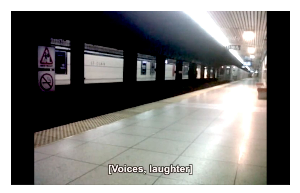
Figure 5. A still frame showing an empty subway station platform as a train leaves the station, with a caption reading '[Voices, laughter]' appearing at the bottom of the frame. From Leaving Eustachian by jes sachse.

Offering an intricate, intimate soundscape of the subway, sachse playfully contests hearing as an able-bodied privilege. The harshness of subway sound - the roar of the