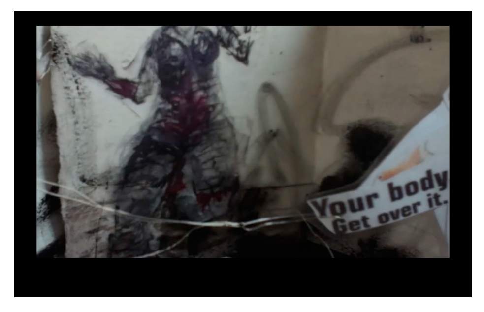
Figure 3. Still frame depicting a drawing of a figure seated in a wheelchair placed beside the words, 'Your body. Get over it'. From slide/cascade by Elaine Stewart.

order to be freed from the cultural scripts of lack and deficiency that disability attaches to our bodies.