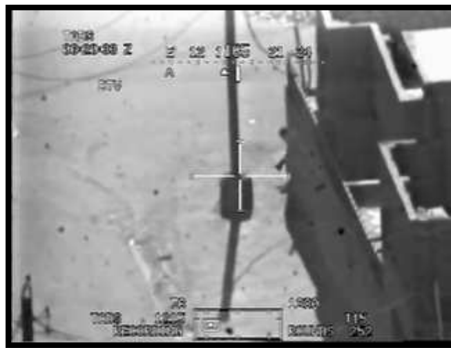
Figure 1. The view from above.

were photographs taken before and during the attack by killed Reuters journalist Namir Noor-Eldeen and video of testimony by and images of a US soldier, Private Ethan McCord, who had been a member of the unit tasked with the 'clean up' after the attack and was visible in the Apache footage. Three visual configurations were therefore at play in the text. They mapped onto three locations of war experience and violence, and three associated war subjects. The first mode of vision is the view from above: the perspective of the Apache helicopter crew through the gun sight, which would have been their means of seeing the ground far below (Figure 1). The second is the view from below: the perspective of killed Reuters photojournalist Namir Noor-Eldeen (Figure 2) who took photographs up to the moment of the attack (Figure 3), including of the sky; a return of the downward gaze. The third is the view of the 'on-the-ground eyewitness': Private Ethan McCord who is seen briefly in the Apache footage carrying an injured child from a shot-out vehicle. A video of his speech at a peace conference is intercut with photographs apparently taken by soldiers including one of him stained with the blood of the children he carried (Figure 4).