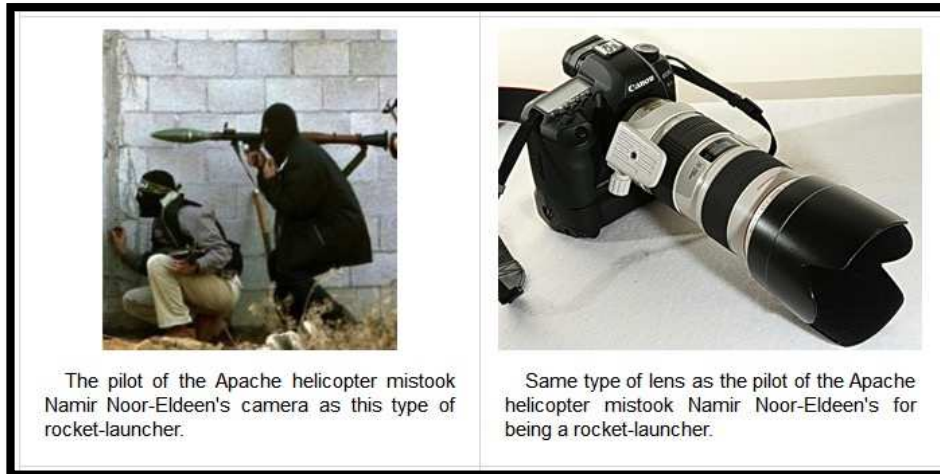
Figure 2 'Resources' on the WikiLeaks Collateral Murder website