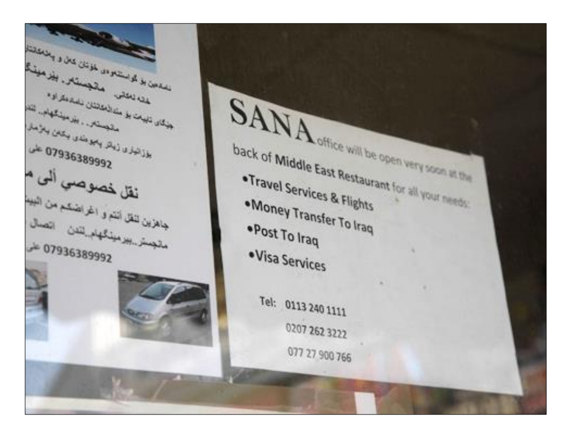
[Figure 9. Multilingual travel services.]

Multilingualism here is more visible because a smaller number of expert languages used means that writers of the signs can use languages other than English: the need for English as a lingua franca is not so pressing. Cherry Row is also home to very recent arrivals, without the competence in English literacy of more established migrants.