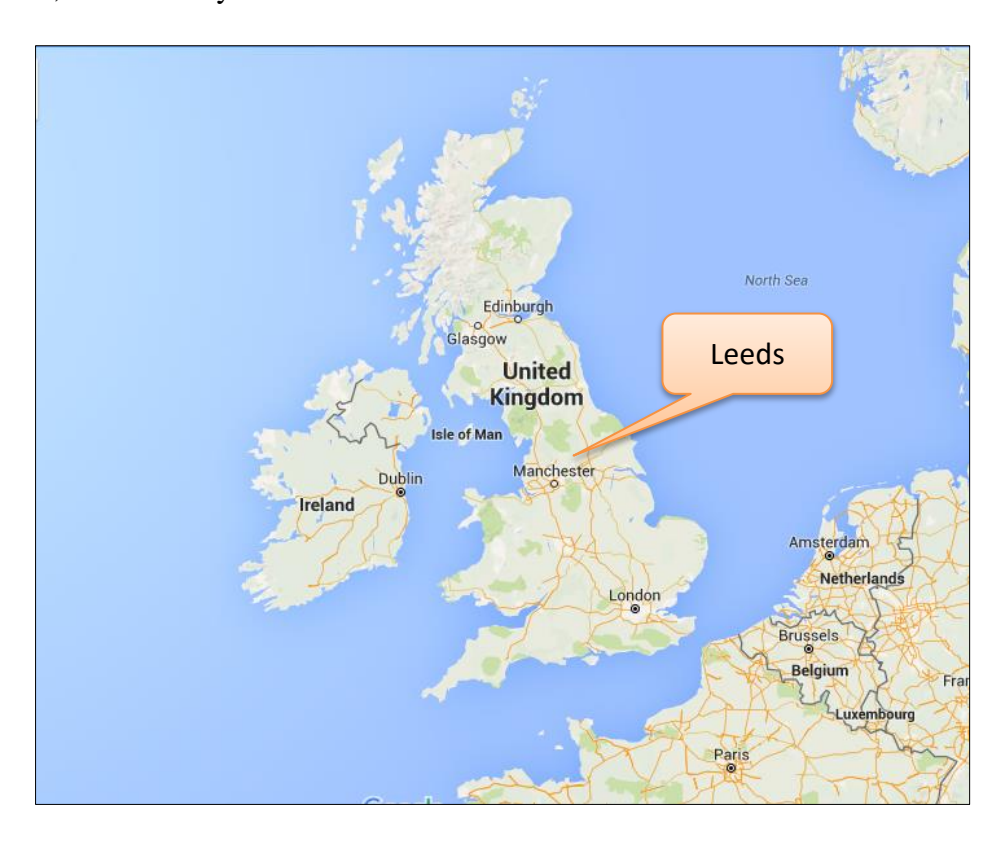
[Figure 1: UK, with Leeds indicated. Map data ©2015 Google]

The reality of contemporary multilingualism will be familiar to anyone who lives or works in an urban area. In the TLang project we look at language practices over time in public and private settings in four cities in the UK, to understand how people communicate multilingually across diverse languages and cultures. The overarching research question is: How does communication occur (or fail) when people bring different histories and languages into contact? One of the cities is Leeds, in the North of England. The Leeds TLang team are carrying out most of their research fieldwork in Harehills, an inner-city area a mile to the north-east of the centre of Leeds.