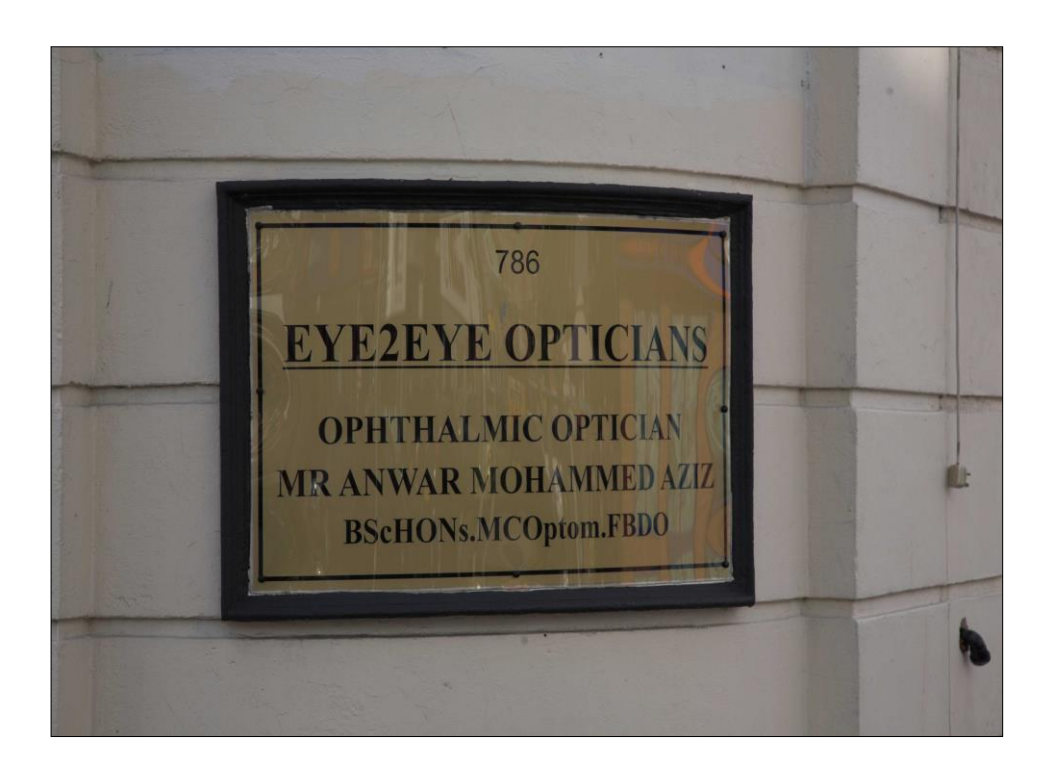
[Figure 6. Optician sign on Roundhay Road.]

This optician's business is owned and run by someone from a South Asian background who does not live in Harehills but works there. The signage is in English: the lingua franca is used to appeal to a linguistically-diverse potential clientele, who also might have travelled across the city to Roundhay Road to visit their optician.