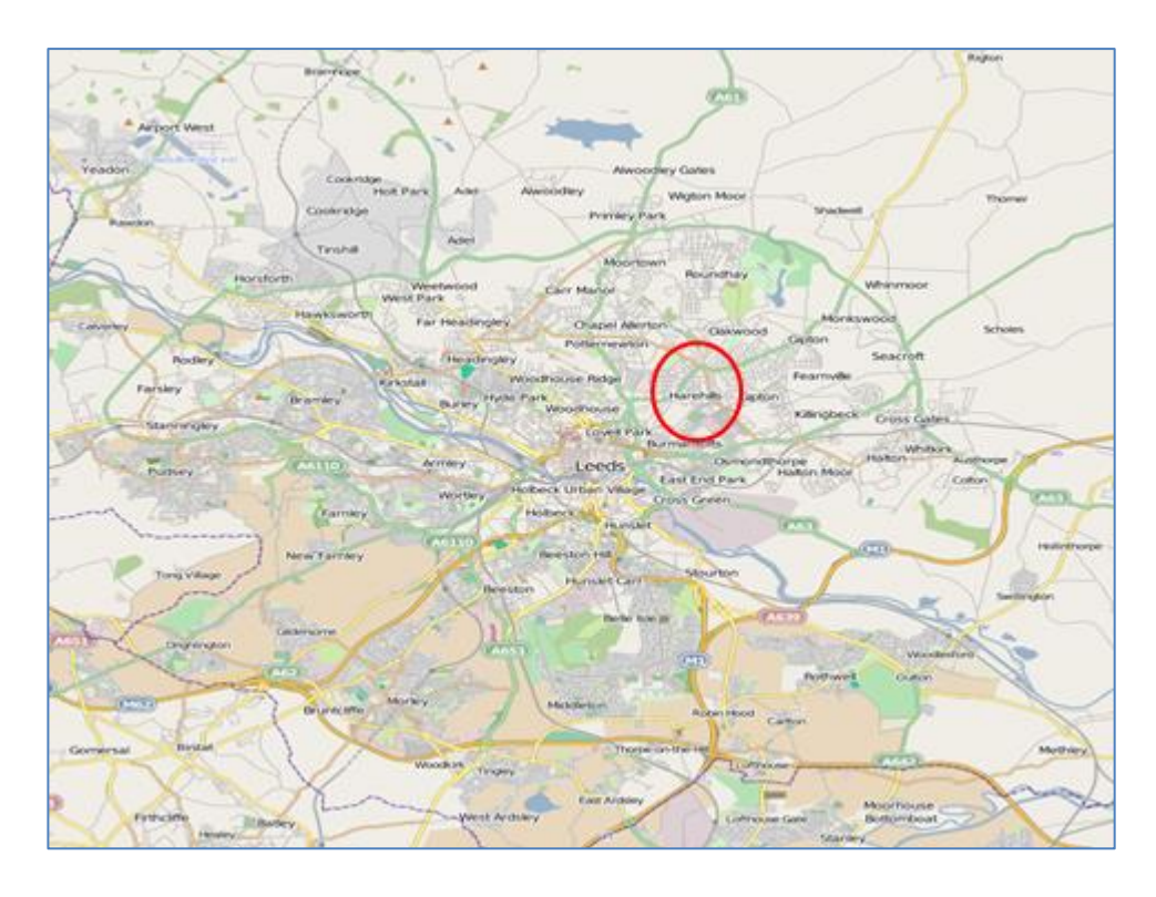
[Figure 2: Leeds, indicating Harehills, 1.5km from the city centre.]

We characterise Harehills as superdiverse , like many of the world's urban areas. The term superdiversity was coined by the sociologist Stephen Vertovec: his 2006 paper is usually cited as the original source. Superdiversity for Vertovec refers to a diversity which exists not just in terms of where people come from, but other variables including 'a differentiation in immigration statuses and their concomitant entitlements and restriction of rights, labour market experiences, gender and age profiles, spatial factors, and local area responses by service providers and residents' (Vertovec 2006: 1; see also Cooke 2010). The notion has been taken up and developed by sociolinguists interested in mobility, for instance Blommaert and Rampton (2011):