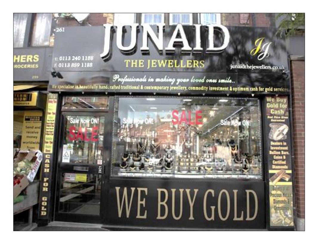
[Figure 5. Junaid, Roundhay Road.]

Historically the linguistic landscape of Roundhay Road seems to represent quite an advanced stage in the evolution of a migrant ecology, with two communities (Pakistani, Bangladeshi) having settled in the neighbourhood and becoming home and property owners. Others from these and other communities who arrived at the same time have migrated to more affluent areas of the city. These groups, however, are still represented in the neighbourhood by businessmen and women, members of the professions (health, law, education, charities, advocacy and advice), who have moved out of Harehills but still do business there.