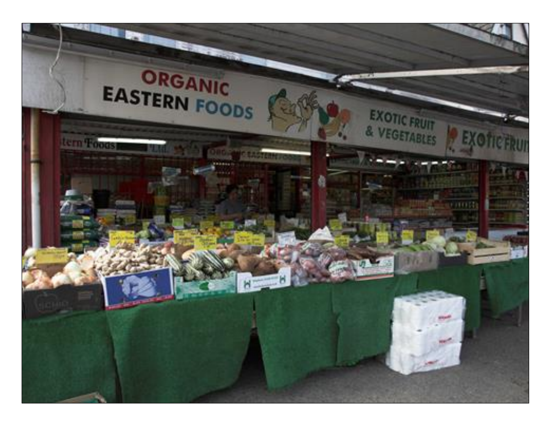
[Figure 8. Monolingual signage; multilingual customers.]