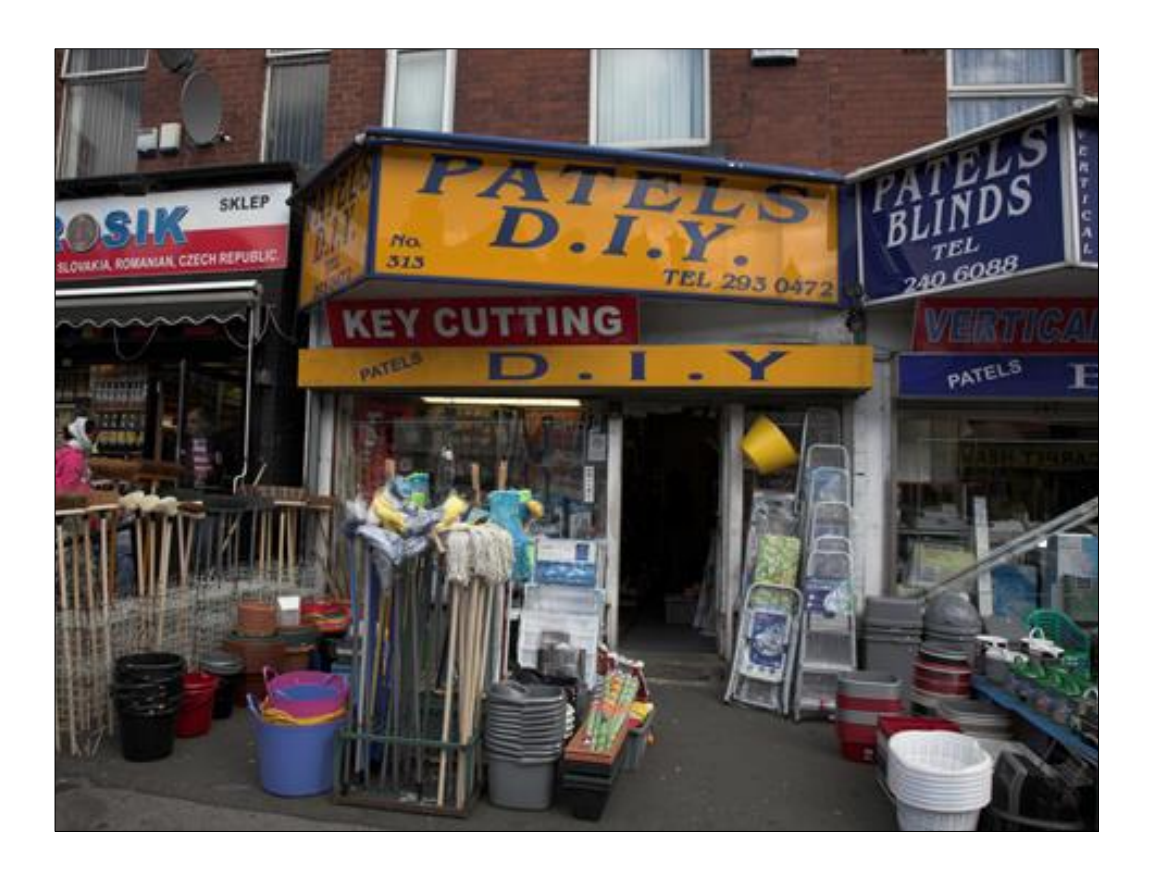
[Figure 7. Shop on Harehills Lane.]

These newer groups are much smaller, more numerous, and therefore less cohesive than those which arrived in the last century, though like the first Asian migrants, newcomers are in many cases single and male. On Harehills Lane too we observe the trend towards monolingual English signage in shops, as the range of expert languages used in a neighbourhood grows and the need for English as a lingua franca correspondingly increases.