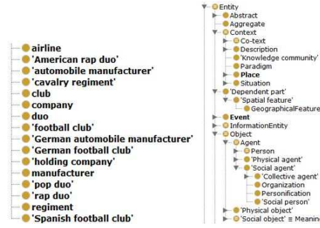
Fig. 2: Parts of Extracted Entity Class and DUL classes

The motivation of class alignment method in our experiment is to investigate how LOD datasets (typically DBpedia) can facilitate the alignment of heterogeneous type information. Our alignment method is based on the heuristics that the linked data resource is typed and linked by their dereferenceable URIs. For example (in Figure 2), to identify whether a football club is type of “dul:Agent” 17 , we can ask this question based on LOD knowledge base (typically DBpedia in our case), which can be constructed in the following SPARQL query.