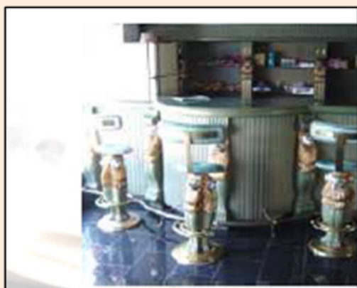
Figure 11: Gold plated stools at a cartel's home [17].

Figure 11 shows furniture that was found at a cartel's home and part of the stools are gold plated. This shows the kind of lifestyle that the drug dealers at the top of the business have and gives an insight into reasons for why they would continue being in the trade. There are various different cartels across South America and the drug-related crimes between gangs cause many homicides from shootings [27]. It is estimated that in 1993, the Cali cartel in Colombia, which had the majority of control over the cocaine trade at the time, was earning an estimated £16 billion each year [29]. From looking at that statistic it is no wonder that the cartels are at war with each other to get control over this trade as the income is extortionate.