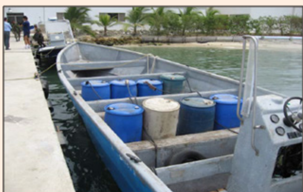
Figure 9: Image of a small boat used for shipping cocaine out of South America [17].

There are many different methods of trafficking including by sea either on fast boats or bigger ships, by air on small aircrafts and by land crossing borders. No matter which method is chosen, the aim remains the same that the drug barons are trying to beat the customs [10] and maximise the amount of cocaine that reaches the destination. Figure 9 shows a small boat that is used for shipping cocaine. There are so many of these sent out that if a few don't make it, there is no consequence to the drug barons because they make such a vast profit that such a loss is worthless.