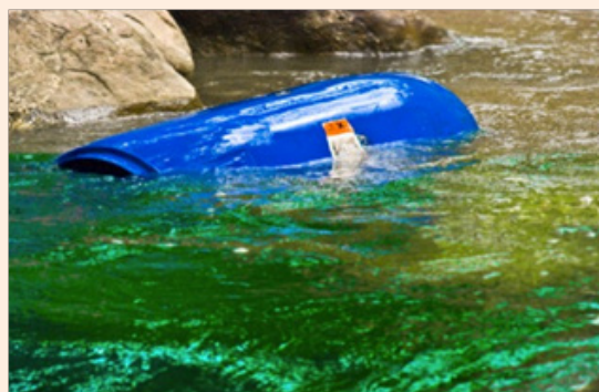
Figure 7: Image showing the waste being poured into the rivers [17].