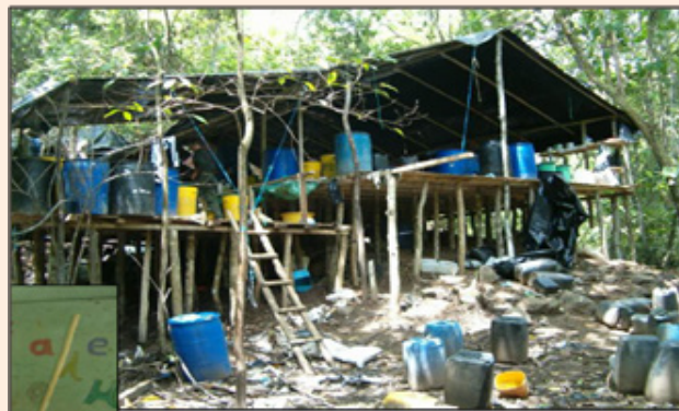
Figure 6: Image showing a typical coca leaf processing plant in the middle of the Colombian jungle [17].

which is the freebase form, powder cocaine is heated with baking powder [16]. The refinery of cocaine often takes place at the home of a cartel (boss in the drug business) and logos are imprinted on the blocks of cocaine as shown in Figure 8.