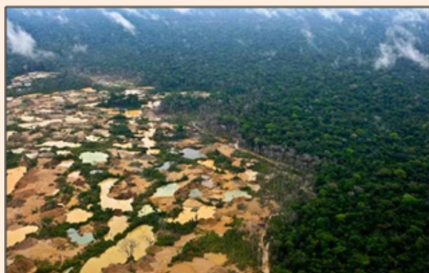
Figure 5: Image showing the deforestation of the Amazon Rainforest for coca plantations [23].

The production of cocaine can differ greatly from large scale productions in clandestine laboratories to small scale productions in jungle huts [8]. However, the method of production remains the same and always takes place in hidden secretive areas covered by trees to prevent being caught as seen in Figure 6. This image shows the conditions of the jungle laboratories; they are dirty, unstable with a shanty structure and the equipment used in not sterile.