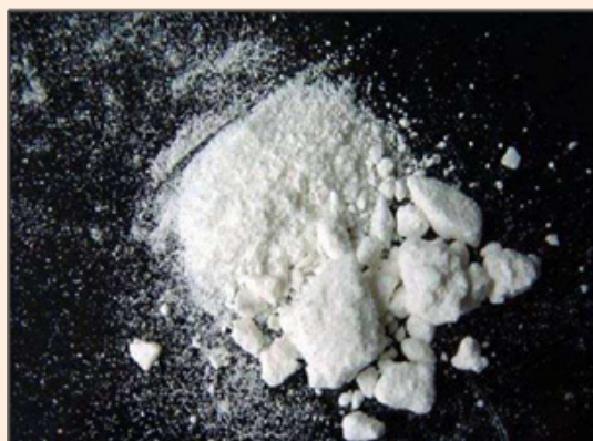
Figure 1: Image to show the appearance of powder cocaine [15].

There are two forms of cocaine as seen in Figures 1 & 2 [15]; the powder form which is a fine white crystalline powder and the crack cocaine which is solid rocks usually of off-white colour [16]. The powder form is cocaine hydrochloride, the salt form, and it is made from the coca paste derived from the coca leaves whereas crack is the freebase form as the salt is removed [6]. Powder cocaine is abused by snorting whereas crack can be smoked as it vaporises at lower temperatures than powder cocaine. Cocaine can also be injected and is more often taken this way when mixed with heroin but this method of use is the least common [6]. Smoking crack is often preferred to snorting cocaine because the effects are more rapid as the freebase crack melts and vaporises under flame [14] and the vapour is inhaled causing immediate effect on the brain. For cocaine addicts, one of the most important things is the sudden rush and speed of onset so as smoking crack is the fastest method to feel the effects, this is considered the best choice to drug abusers [6]. The street slang is a part of the dealing process for gangs because they use it as code for what they are really selling. Cocaine has names such as 'snow' and 'dust' because of its powder form and crack is often called 'rocks' and 'teeth' because of its appearance. Other names that are also well-known are 'Charlie', 'white lady' and 'coke' [10,17] (Figure 3).