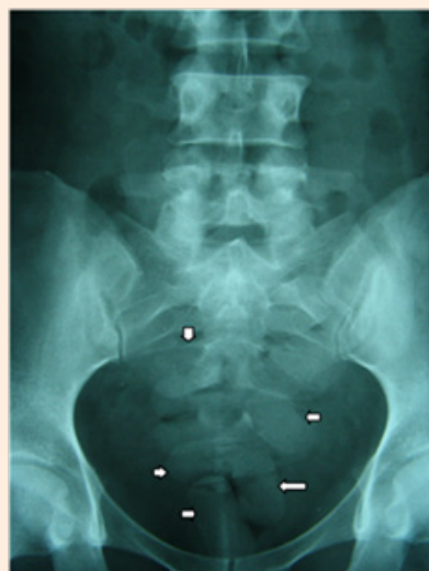
Figure 10: Image showing the pellets of cocaine inside a body packer [26].

through customs. Cocaine is the most common drug involved in body stuffing [25] and it poses serious risk to the drug mules [26]. Figure 10 shows the cocaine pellets that have been swallowed by a body packer. There can be up to two kilograms of cocaine swallowed in pellets at one time and lubricant jelly and tubes down the throat are used to aid the process. Although the medical risks are serious there is also the risk of imprisonment but this is not enough to stop the drug traffickers because their income takes priority over the extreme risks and they have to do this in order to make a living.