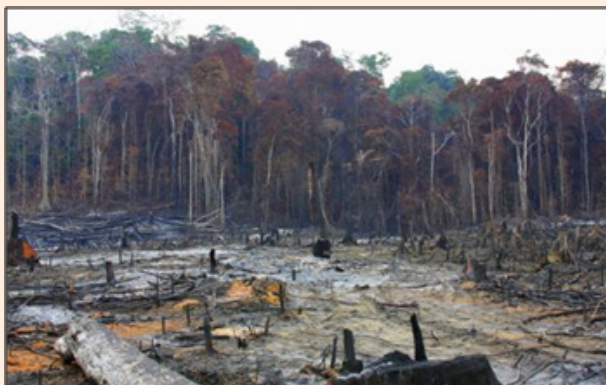
Figure 4: Image showing the deforestation occurring due to coca plantations [23].