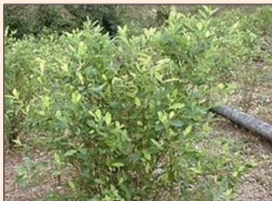
Figure 3: Image of a coca plant [17].

Although cocaine is now a controlled substance and seen as a highly dangerous drug, this is the opposite of how it was seen in