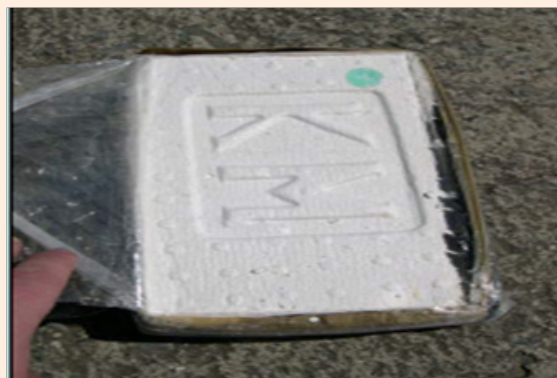
Figure 8: Image showing the logos imprinted on cocaine blocks [17].

Although those that are involved in the production of cocaine in the jungles of Colombia, Bolivia and Peru do not earn good money, it is the best option and income that they will ever be offered in their lifetime [8] and this means that they would rather