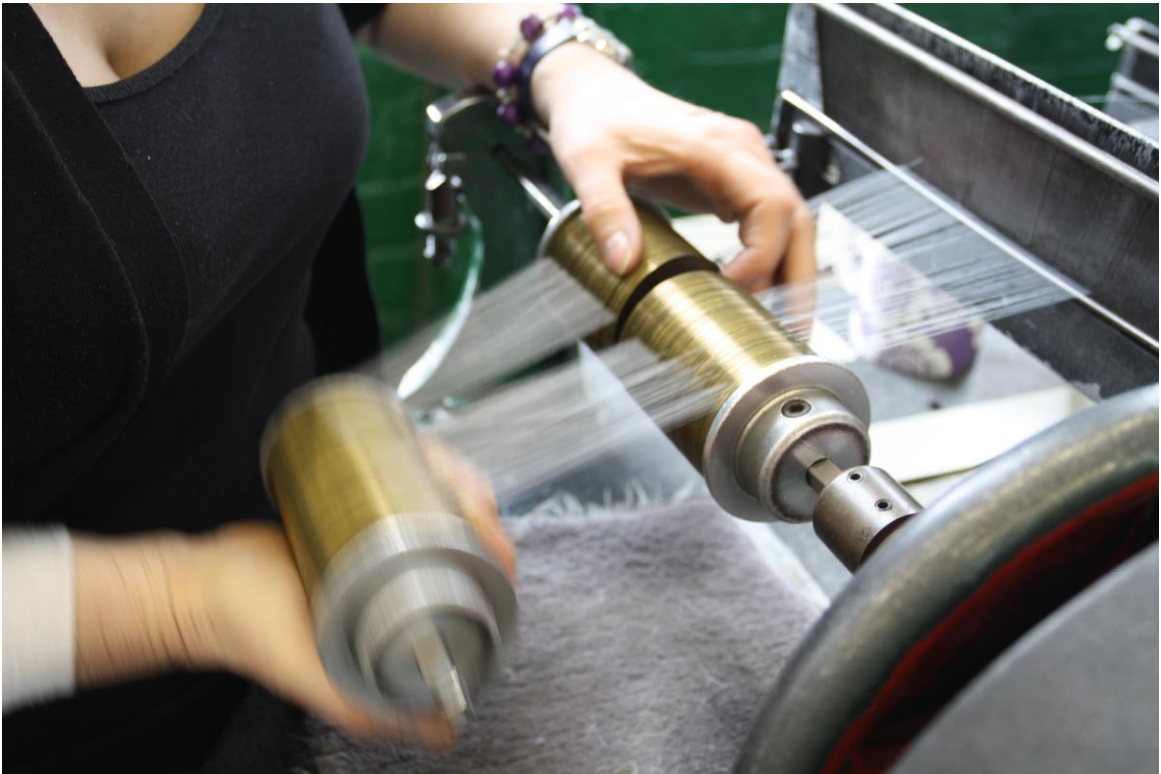
Figure 4: Bobbin winding at Cluny lace in 2013

intangible industrial heritage, the research team will work with Nottingham Trent University undergraduates as trainees and research participants. Their involvement will make it possible to validate the enhanced learning material, testing its effectiveness before it is used to augment the training of volunteers at RFKM. In anticipation of enthusiasm for framework knitting, its heritage and the creative potential and entrepreneurial possibilities that it offers, four of the research participants will receive training as trainers. This will mean that the enhanced training materials will ensure a multiplier, or ripple effect that helps pass on framework knitting skills, thereby sustaining this important aspect of industrial textile heritage for future generations.