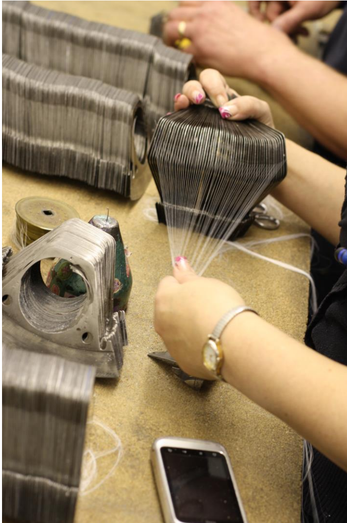
Figure 3: Bobbin threading at Cluny lace in 2013

The research team therefore propose to use 3D animation to clearly show the relationship between the knitting frame's mechanism and the experienced operator's physical actions. We aim to do this by combining the animation with visualisation of how the knitter uses their eyesight to attend to the process, based on information generated through eye tracking technology. Although a 3D animation is a depiction, a representation of the human/machine relationship in the framework knitting process rather than an immersive experience, the team anticipates that enhanced learning and capability will arise from the addition of 3D animation to the existing, traditional training practices. Far from being a series of static, illustrative diagrams the 3D animation can depict the rhythmic 'dance' of the operator and machine in harmony, which through haptic perception (Freedberg & Gallese 2007, Fauconnier & Turner 2003) helps novice operators, and other audiences, to form a 'sympathetic corporeality', to feel the actions that they see, and consequently more deeply understand the process.