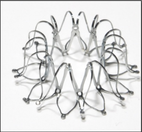
Figure 1: Corvia Medical, Inc. IASD® System II device.