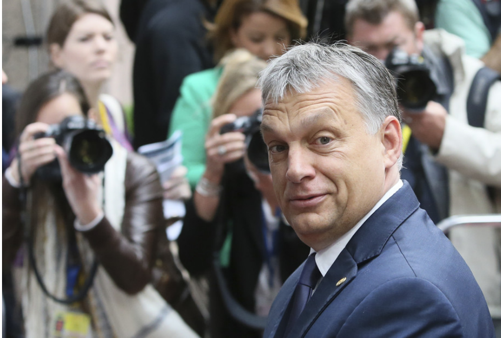
Orbán is on a high after the Brexit vote.