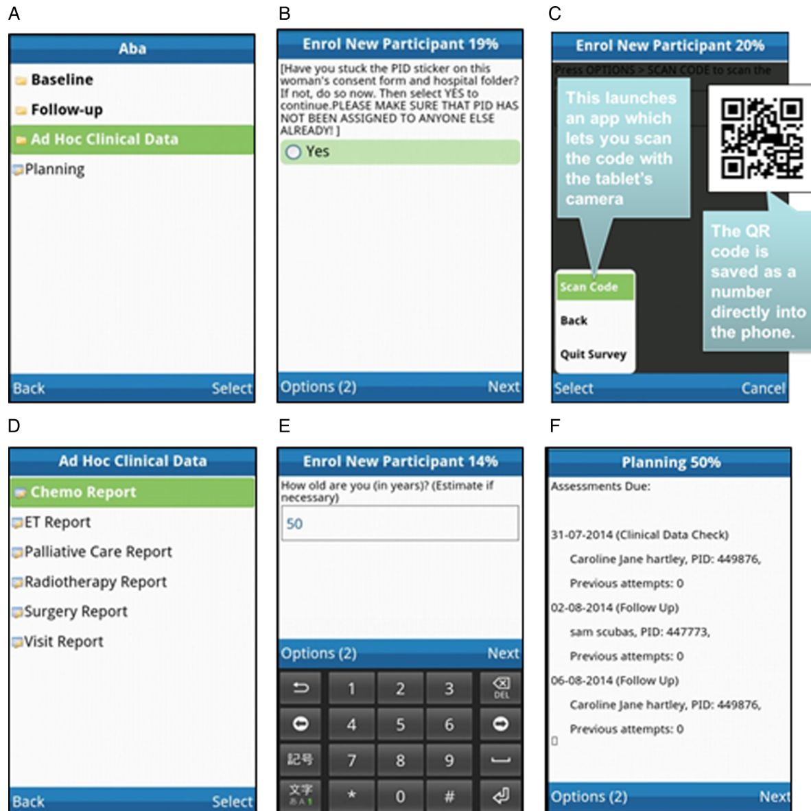
Figure 3 (A) African Breast Cancer—Disparities in Outcomes (ABC-DO) mobile phone application: appearance of outer folder. (B) A reminder to the research assistant to assign a new participating woman a new ID number. (C) Scanning of two-dimensional ID barcodes avoids data entry errors. (D) Reports for treatment information. (E) Example of data entry screen for a numeric response (age). (F) A constantly updated list of follow-up calls that are due (the names shown here do not correspond to the real names of any of the study participants).

Fields for the follow-up have been added so as to implement the ABC-DO design.