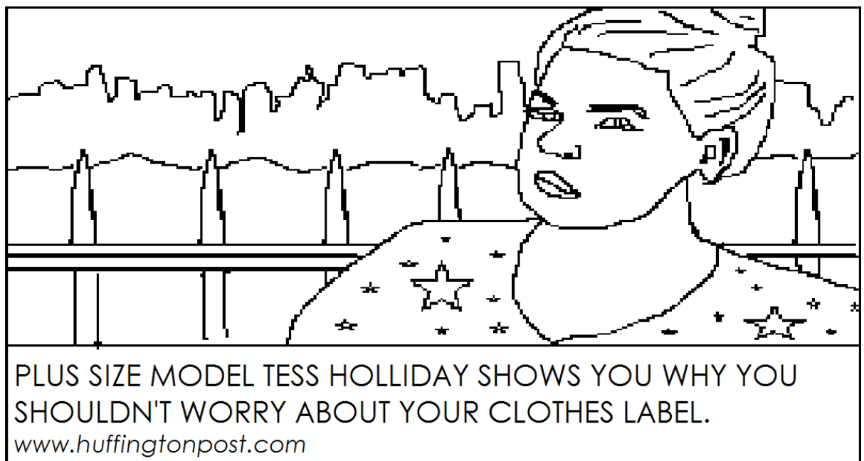
Figure 2. Media coverage of above Tess Holliday's Instagram post

article covered Holliday's post. It was titled " Plus Size Model Tess Holliday Shows Why You Shouldn't Worry About Your Clothes Label " (see Figure 2).