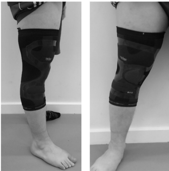
Fig. 1. Experimental knee brace.

Finally, participants were asked to subjectively rate the Trizone knee sleeve in relation to performing the movements without the brace in terms of stability and comfort. This was accomplished using