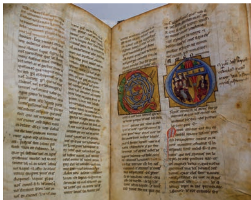
Figure 2. Carpentras, Bibliothèque municipale 473, fols. 117v-118r. Ending of the Histoire des moines d'Égypte .