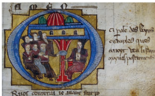
Figure 3. Carpentras, Bibliothèque municipale 473, fol. 118rb. Postumien teaching.