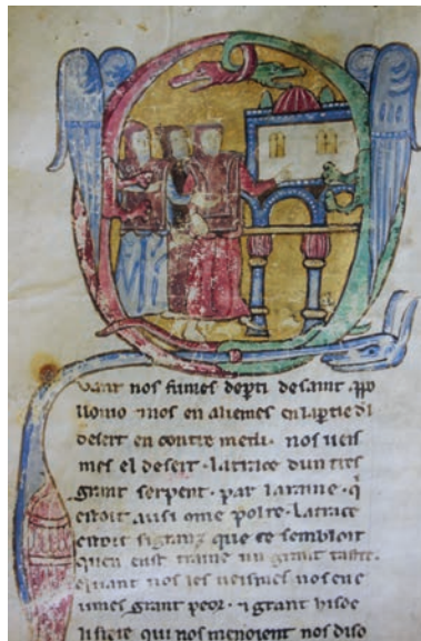
Figure 4. Carpentras, Bibliothèque municipale 473, fol. 103ra. Postumien and his monks in the desert. Reproduced with permission of the Carpentras bibliothèque-musée Inguimbertaine. All rights reserved.