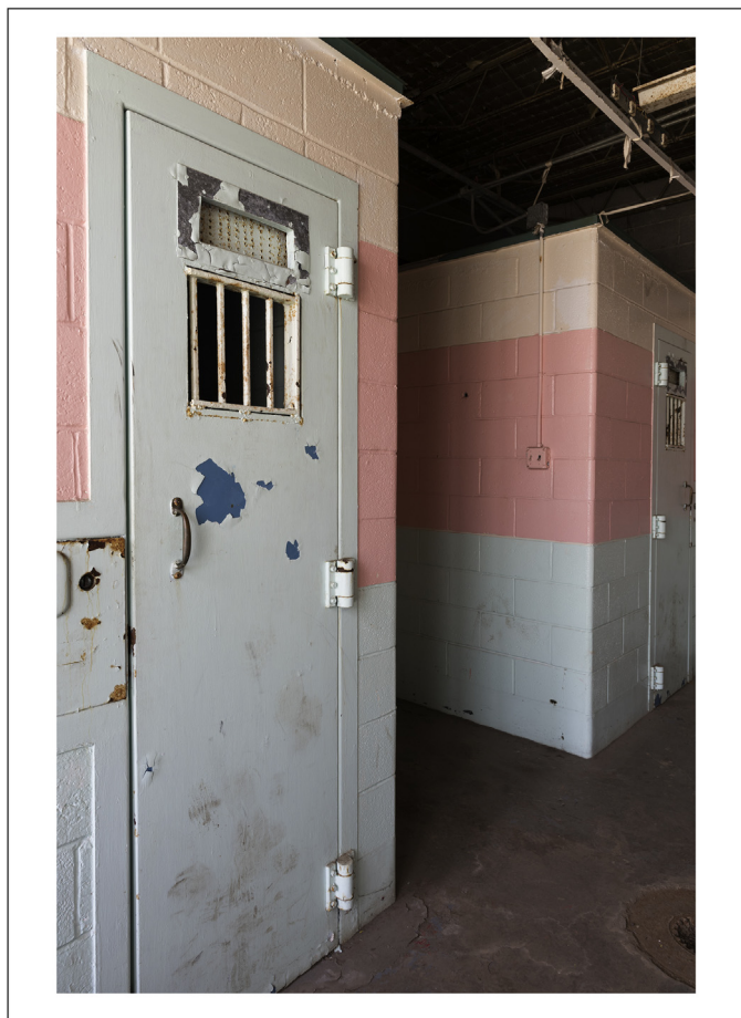
Fig. 3. Solitary confinement cells at the West Virginia State Penitentiary, a retired, gothic-style prison in Moundsville, West Virginia, that operated from 1876 to 1995.

discussed at the recent London workshop, highlighted the “toxic” effects of segregation, caused by “social isolation, reduced sensory input/enforced idleness and increased control of prisoners even more than is usual in the prison setting.” 12 Over half of the sixty-three individuals interviewed reported that they had three or more of the following symptoms after forced isolation: anger, anxiety, insomnia, depression, difficulty in concentration and self-harm. 13 In the words of one of the prisoners interviewed: “The longer you’re here, the more you develop disorders. Being in such a small space has such an effect in decreasing your social skills. It looks rosy, but it has such a negative effect. It’s isolation to an extreme.” 14