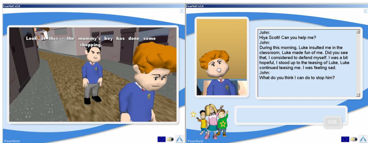
Figure 1. Screenshots of cartoon-like and interaction episodes within FearNot!.

the interaction situations and the characters' goals and mental states. These cartoon-like episodes are connected by interactive episodes where the user can 'talk to' the victim character via an instant messenger inspired interface i.e. by typing into a text box and reading the character's responses on screen. Here, the user can recommend coping strategies for the victim character to attempt in the following emergent episode.