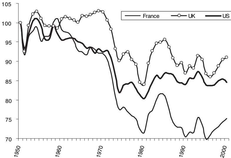
FIGURE 1C. TRADE COST INDICES, 1950–2000 (1950 = 100).

both only marginally. Finally, membership in the British Empire appears to have substantially decreased trade costs, although we note that in unreported regressions by period, this effect has strongly diminished through time.