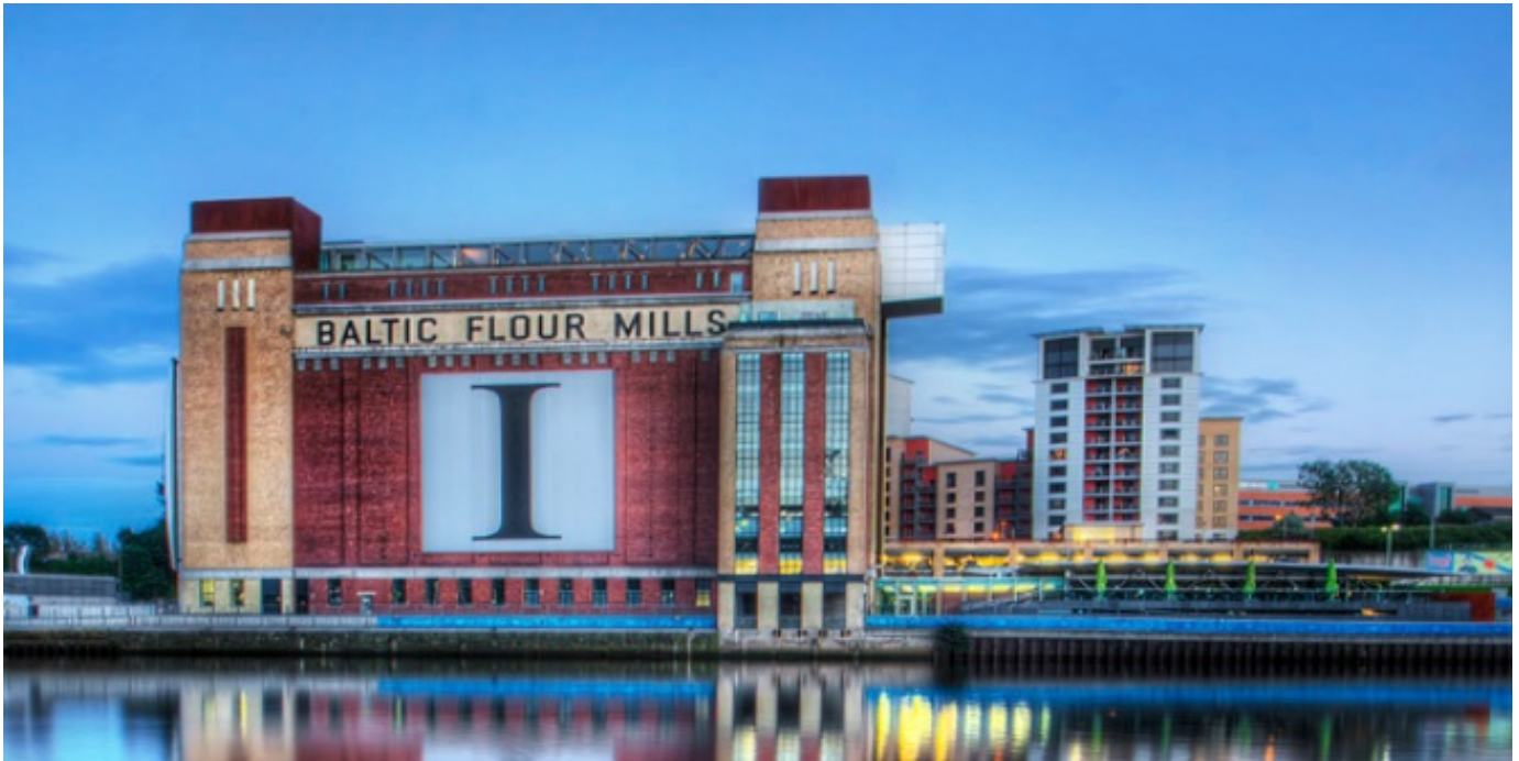
Image Credit: The Baltic Flour Mill, River Tyne, Newcastle upon Tyne (Jimmy McIntyre CC2.0)

Central and Eastern Europe or the US South. Moreover, disparities are growing. Only Scotland, outside of London and the South, has performed relatively strongly. The UK economy's poor recent productivity performance has vexed policymakers, and McCann argues convincingly that it is largely an urban and regional problem. London's economic performance contributes to national averages that disguise the weaknesses in other regions. There is little evidence that other regions benefit from London's growth. Instead, fortuitously capturing the benefits of globalisation through its specialisation in financial services, the attraction of multinational companies, foreign direct investment and international migrants, London has 'decoupled' itself from the rest of the UK economy.