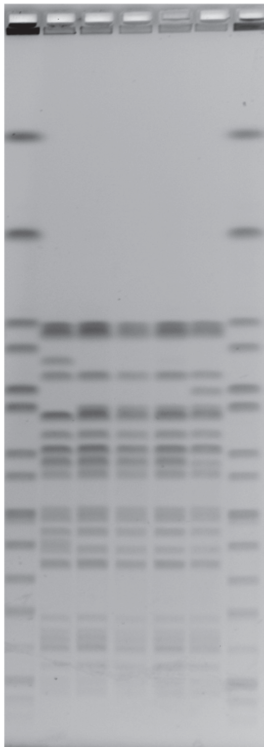
FIGURE 2 Pulsed-field gel electrophoresis (PFGE) pattern of the outbreak strain (middle three lanes) in the national outbreak of Shiga toxin-producing Escherichia coli (STEC) O157 in the Netherlands, December 2008 - January 2009