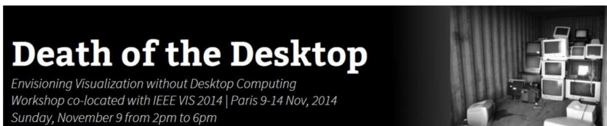
Fig 1. Branding needn't be demanding. The "Death of the Desktop" workshop (see: http://beyond.wallviz.dk/ , https://vimeo.com/102527731 ) had a strong brand that was intriguing, evocative, and memorable. The twitter account (@visfutures) revealed information and contributions in the lead-up to the event. The brand helped to set a tone for the preworkshop submissions and the workshop activities. Consider how effective the brand would have been if the workshop was just called "Consequences of a concerted community focus on visualization technologies and the impact on interaction and display techniques." Would this have been easy to remember or Google? Would this have set a theme that was easy to follow?

Workshops become conferences if they are too big, have too many talks, or if you invite an audience rather than participants. Workshops become group meetings if too many people