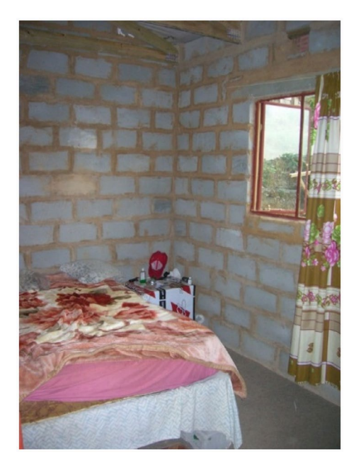
Figure 1. Adult bedroom in Cato Crest (Source: Meth, 2011).

'... If we want to do the thing for old people we don't have to be stressed [about] the children or neighbours' (Mandla Diary CC, 2015) and Thulani explained 'It was difficult before to us as parents of the children to do thing of the old people such as ... [sex]. We always check the children are sleeping before we do anything. I was happy if I see my children playing during the day because I know that they will sleep flat at night even if we pray with the mother they will not hear anything because [they] are tired' (Thulani Diary, CC 2015). Anxiety over lack of privacy in relation to sexuality was a prominent theme among men and women living in shacks (see Meth, 2009) and concerns about how this lack of privacy may foster early sexualisation of young people proved very worrying for shack residents. But the presence of children in single-roomed shacks was not the only difficulty for men. Sfiso describes how his relationship with his girlfriend has been enriched because of his new formal house, and his contrast of rural with shack ways of living drive home the significance of the disparity in housing quality: