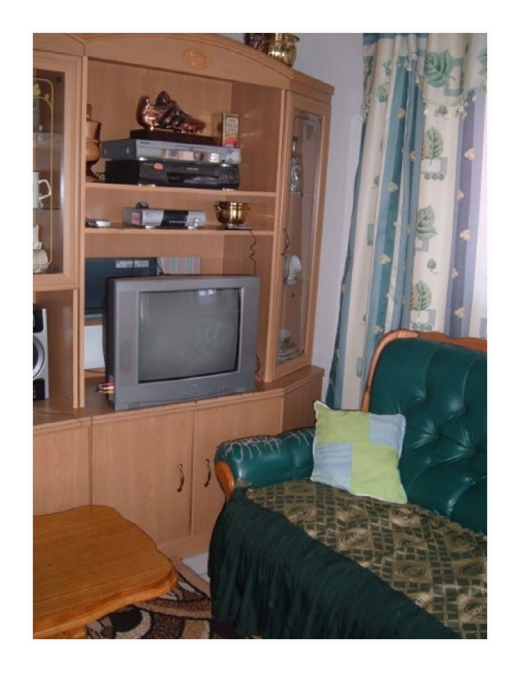
Figure 3. Interior of a new house with consumer items (Source: Charlton, 2011).

money now in these new houses to compare the shack's life because we have to buy thing for the house such as furniture' (Thulani Diary, CC 2015). Difficulties in affordability lead to inter-household jealousies and personal conflict relating to low incomes or unemployment: 'The only thing which is stressing me to look other neighbour's houses look beautiful and my house is not look good because I have failed to have money' (Nkosinathi Diary, CC 2015). These concerns add an important dimension to Gorman-Murray's concept of domestic masculinities, revealing how failed ideals of home-making impact on men's sense of self, and they support Ratele's identification of the perils of consumption in contexts of poverty particularly in relation to a wider trend of consumption-driven masculinities among South African men (Ratele, 2014, p. 34 after Viljoen, 2008).