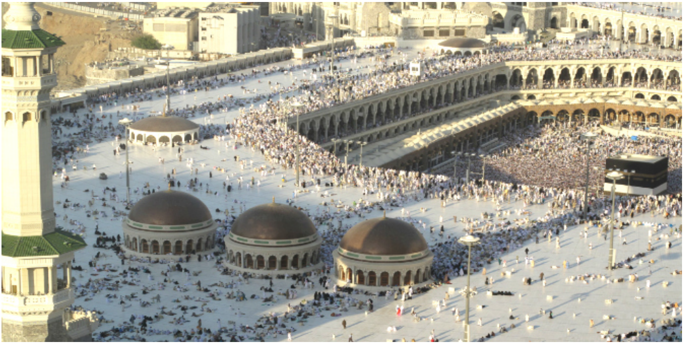
Masjid al-Ḥarām, Mecca, Saudi Arabia, 2009

Across six chapters, Al-Rasheed first discusses the situation prior to and during the 2011 Arab uprisings, stating that unlike in other Arab states, activists in Saudi Arabia could only resort to using strong petitions due to severe restrictions on public protests. These formal petitions carried democratic impulses, calling for more inclusive methods of governance and better relations between rulers and the governed. However, the author notes that during the same period there were also activists advocating for even stricter Islamic law, thus creating a conflict of interests. The author goes on to highlight the immense role that the Saudi Association of Civil and Political Rights (HASM) played during the uprisings. The association mobilised Saudis and organised several online campaigns to advocate for human rights and the release of prisoners of conscience.