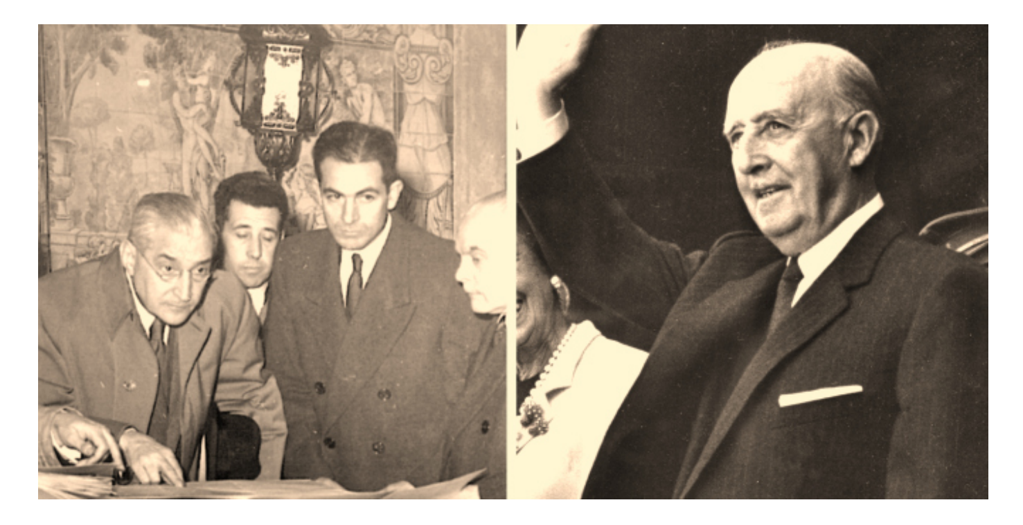
António de Oliveira Salazar, 1954 and Francisco Franco, 1968

theoretical model that tackles the issue of civil-military relationships in a broad manner.