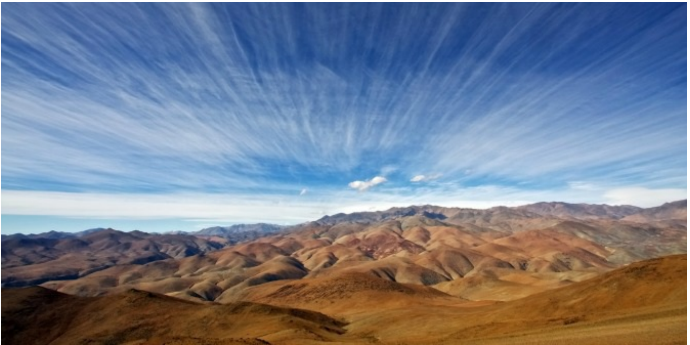
Cirrus fibratus radiatus over ESO's La Silla Observatory [61]

Further issues arise when we consider that the timing of key opportunities for 'impact' can be particularly difficult for academics with caring responsibilities (evening and weekend networking opportunities, for example). There are also basic workload issues that are likely to be more constraining for those with caring roles (several interviewees reflected that they did not feel the demands of achieving impact had been matched by commensurate reductions in other workloads). Since we know that women take on a disproportionate amount of caring work , then this is a gender issue.